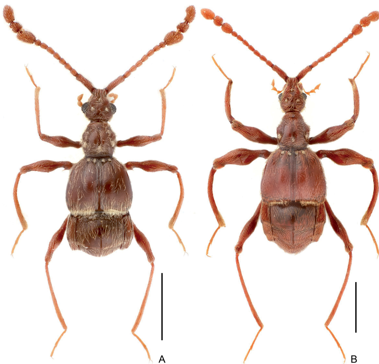
Fig 1. Male habitus of Labomimus consimilis sp. nov. (A) and Pselaphodes lianghongbini sp. nov. (B). Scale bars: 1 mm.