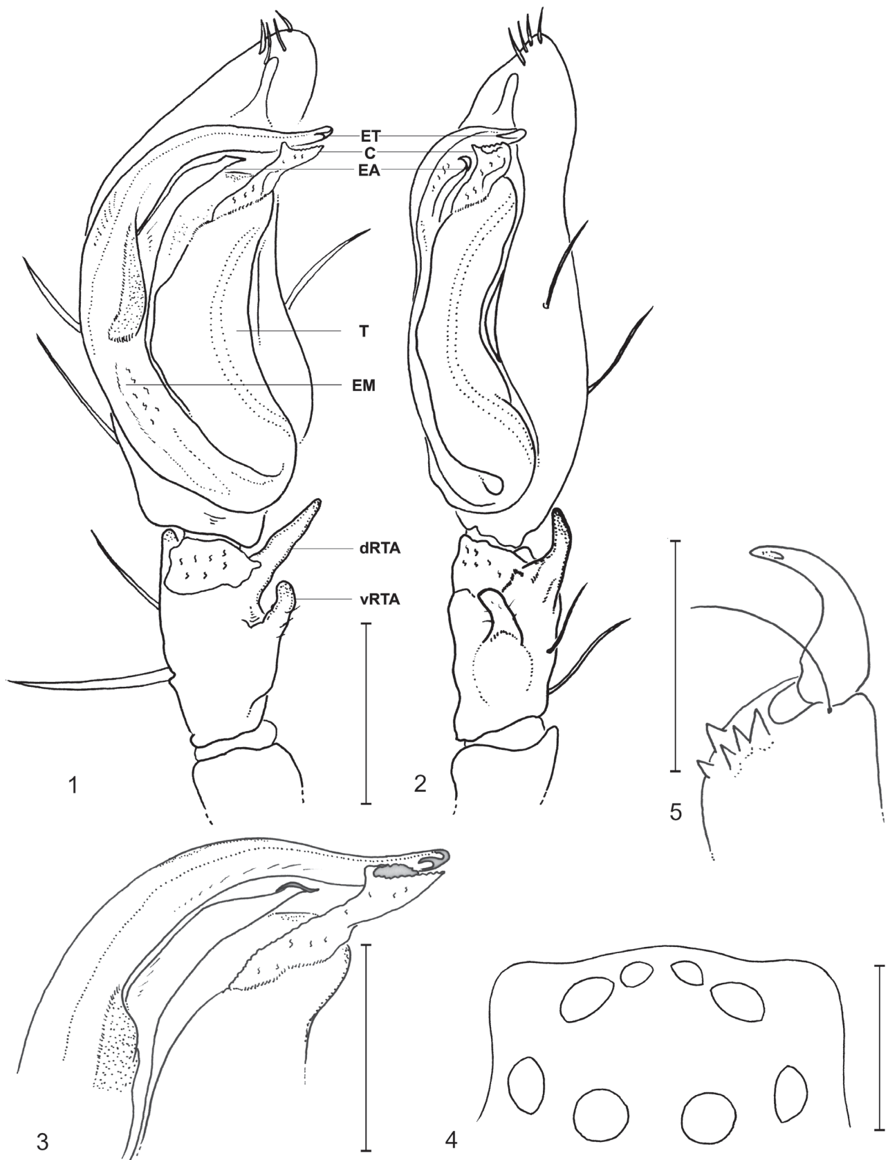
Figs 1-5. Pseudomicrommata mokranica sp. nov., male holotype, Iran. (1-2) Left palp, ventral and retrolateral views. (3) Distal part of tegulum, with embolus tip, embolic apophysis and conductor, ventral view. (4) Eye arrangement, dorsal view. (5) Left chelicera, ventral view. Scale bars = 1.0 mm.