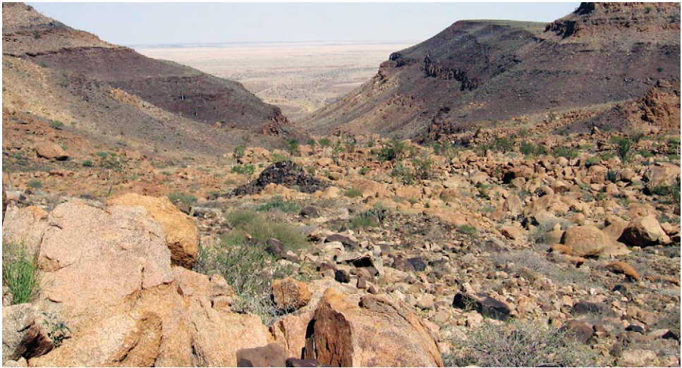
Fig. 5. Brandberg Massif (Namibia), lower slopes of Massif in Goaseb (Ga-Asab) Gorge, facing southwest, wet year. Dominant vegetation, Acacia montis-usti Merxm. & A. Schreib., Commiphora sp., Euphorbia sp. and Moringa ovalifolia Dinter & A. Berger. Rocky flats and slopes, habitat of Hottentotta conspersus (Thorell, 1876), Hadogenes tityrus (Simon, 1888) and Opisththalmus ugabensis Hewitt, 1934.