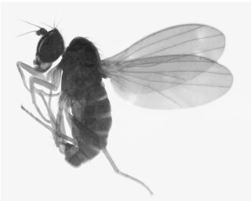
Fig. 1. Meuffelsia erasmusorum Grichanov, sp. n., general habitus of the holotype in alcohol before dissection.

Length less than 2.0 mm; body dark, with dark setae; dorsal part of postcranium slightly concave; face without setae, relatively broad, slightly narrowed downward; pedicel globular; postpedicel small, subtriangular; stylus dorsoapical; labella with 6 pseudotracheae; posterior part of mesonotum distinctly flattened and slightly depressed; acrostichals biserial; 6 dorsocentrals; scutellum with 2 strong bristles and 2 minute adjacent lateral hairs; fore and mid coxae with anterior and apical cilia; hind coxa with