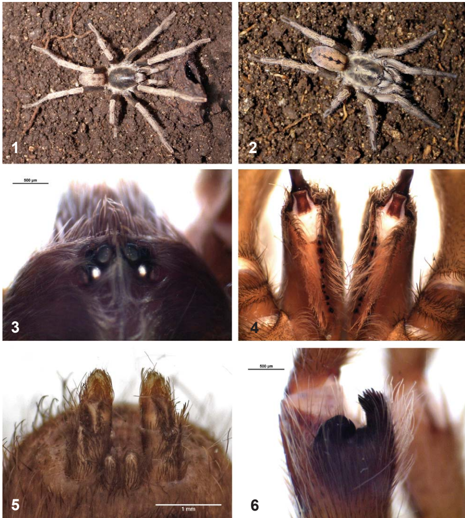
Figs 1–6. Nesiergus insulanus : (1) male with abdominal markings and femora darker than other leg segments and palpi clearly visible; (2) female with abdominal markings clearly visible; (3) dorsal view of eye pattern, displaying procurved anterior row and recurved posterior row; (4) ventral view of chelicerae, indicating position of fangs and size and arrangement of cheliceral teeth on promargin; (5) male spinnerets, showing PLS with differing segment lengths and diagnostic triangular apical segments; (6) tibial apophysis.

to labium, serrulae present on anterior lobe. Labium slightly longer than wide, length 1.26, width 1.12, with ca 47 cuspules limited to the centre. Chelicerae with 12 teeth of differing sizes on promargin (Fig. 4).