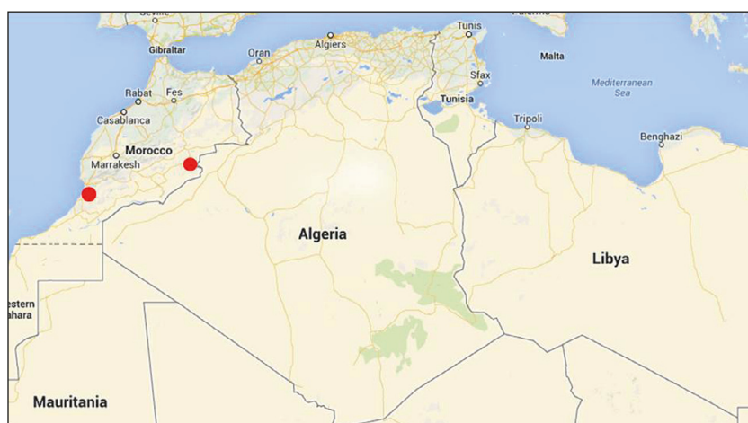
Fig. 17. Distribution of Cithaeron dippenaarae sp. n.