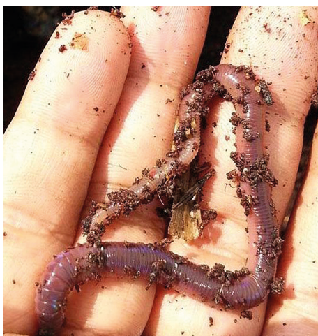
Fig. 1. A Eudrilus eugeniae specimen from a vermicompost site.