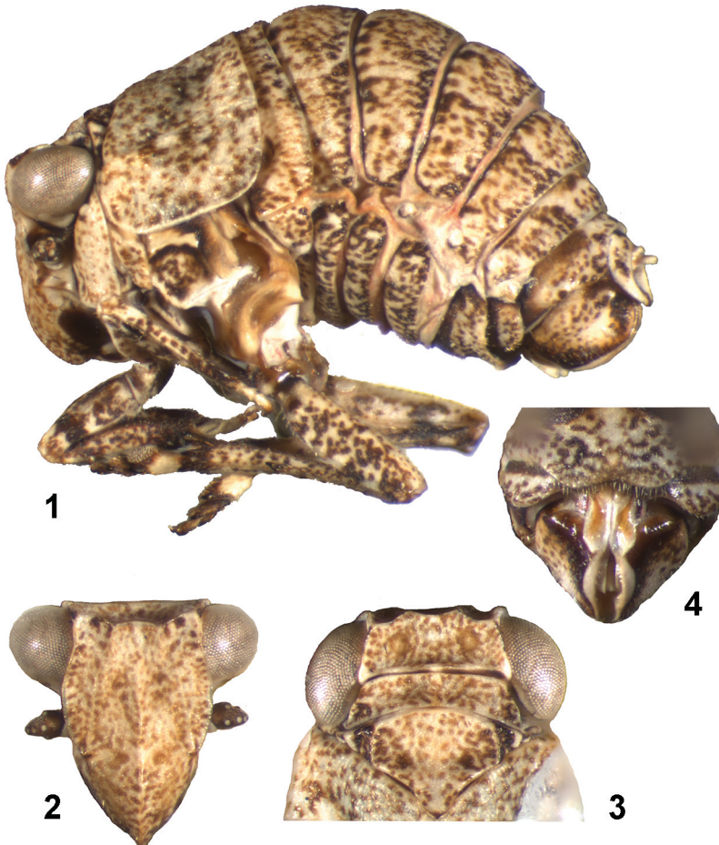
Figs 1–4. Campures pallens gen. et sp. n., holotype: (1) lateral view; (2) frontal view; (3) head and pro- and mesonotum, dorsal view; (4) ovipositor and VII sternum, ventral view. Total length of the specimen: 3.2 mm.

Coloration: General coloration light-brown yellowish with dark-brown spots and dots (Figs 1–4). Genae with dark-brown spot above the scapus. Pedicel dark brown with light-yellow sensory organs. Postclypeus with large oval dark-brown spot on each side. Apex