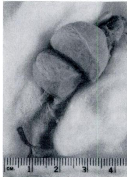
FIGURE 1. Testicular tumor from largemouth bass showing fibrous, swollen cut surface.

The cell morphology, banding and growth patterns, and staining characteristics of the lesion indicate a leiomyoma