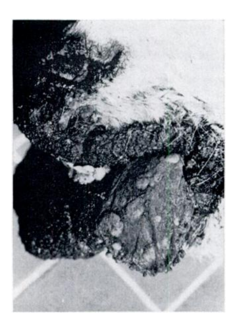
FIGURE 2. Contagious ecthyma in a bighorn sheep. Lesions on the nose, lips and tongue.

(Fig. 3); blackened proliferations could also be found on the dental pad, hard palate and at the base of the molars.