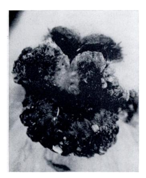
FIGURE 4. Lesions of contagious ecthyma on the lips of a mountain goat.

Examination of the remainder of the carcass revealed numerous pulmonary