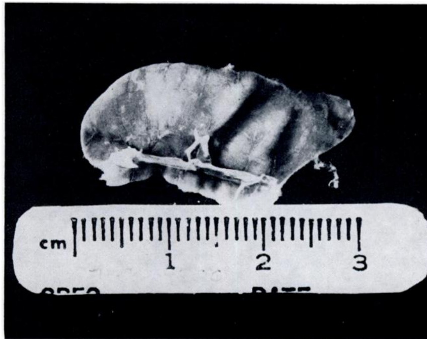
FIGURE 2. Pale tan foci in the submucosa are visible through the serosal surface of the intestine of a red-headed falcon (case 2).

In the bone marrows the grossly observed focal lesions were found to be islands of coagulative necrosis, often containing much nuclear debris, in a sea of degenerating erythroid and myeloid elements. The marrow sinusoids and vessels were intact except in the areas of coagulation necrosis. In the gyrfalcon (case 6) there was necrosis of the bone marrow in the myeloid spaces of the ossified tracheal rings. Inclusion bodies were present but not numerous.