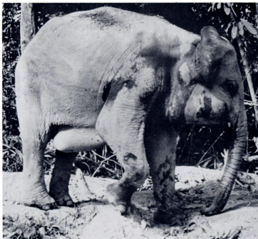
FIGURE 1. Asian elephant showing clinical signs of submandibular and ventral oedema associated with anemia and hypoproteinemia and infection of Fasciola jacksoni .

Sulphobromophthalein (BSP) liver function tests were performed on four elephants including Kala. A polyvinylchloride cannula was introduced into a marginal ear vein of each ear, and