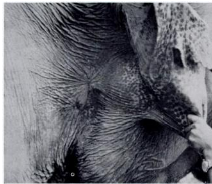
FIGURE 3. Same lesions as in Figure 2 after two months.

stone eggs were present in most fecal samples, the elephants were given thiabendazole □ three months after treatment with nitroxylin because the strongyle egg count was up to 200 eggs per gram in one elephant. Numerous nematodes identified as Murshidia murshida and Quillonia renneie 12 were passed in the feces the day following treatment with thiabendazole.