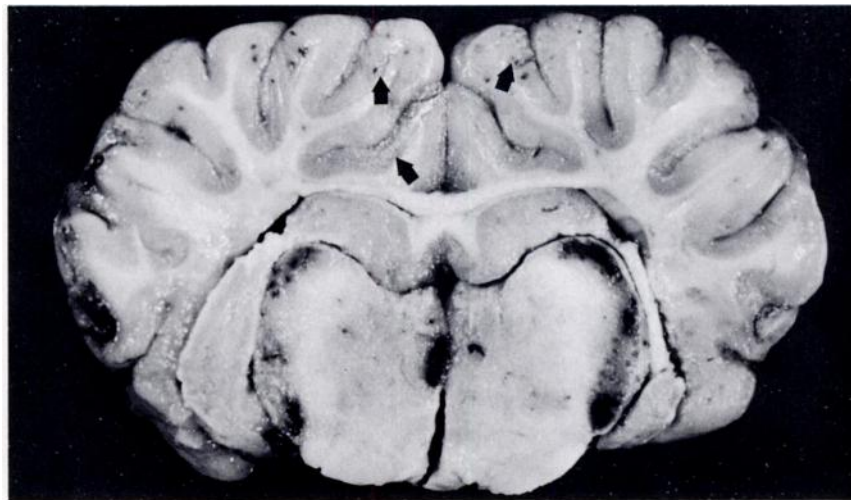
FIGURE 2. Cross-section of brain of pronghorn with PEM-like disease (Case B). There is hemorrhage in the thalamus, including the lateral geniculate nuclei, and petechiae and softening are evident in the grey matter of the cerebral cortex and thalamus (arrows).

The microscopic lesions in cases A and B were very similar. Changes in the cerebral cortex were restricted to the grey matter and were somewhat focal, involving the sides and tips of the gyri, but tending to spare the depths of the