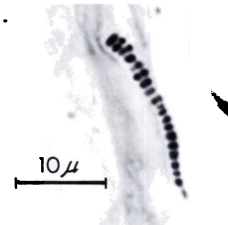
FIGURE 2. Skin section with multiseptate filament of D. congolensis (Giemsa stain).

Visceral organs appeared on gross examination to be normal, except for the liver, kidneys, and bladder. Possible necrotic lesions were noted on the surface of the liver, and small, raised lesions were observed on the inner surface of the bladder. The skeletal musculature appeared atrophic and the femur marrow was red and