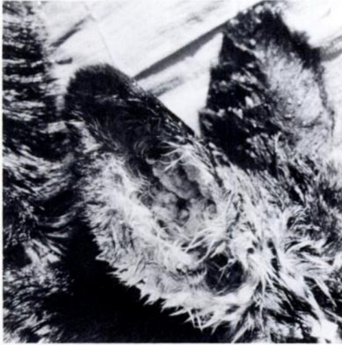
FIGURE 1. Ear of infected animal, with canal nearly obliterated by encrustations.

scapulae, snout, eyelids, periphery of the lips, and the outer and inner surfaces of the ears. The encrustations on the ears were so thick that the outer ear canal was nearly obstructed (Fig. 1).