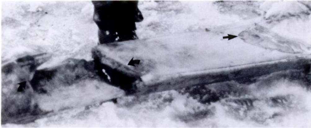
FIGURE 1. Proximal (to the right) and distal (to the left) fragments of fractured right mandible of a female bowhead whale, shown after all overlying tissue had been removed. Curved arrows indicate fracture site, which has been separated by approximately 0.5 m. Straight arrow on proximal fragment indicates demarcation between devitalized tissue (to the left) and apparently healthy tissue (to the right). Note the absence of a callus.

and 25 cm wide in the center, was fractured approximately midlength. The broken ends were not overriding. The bone was gray, apparently necrotic and free of periosteum for approximately 1 m cranial and caudal to the fracture site (Fig. 1). The 1 to 3 cm tissue layer immediately overlying this 2 m of bone was necrotic and stripped easily from the bone. There were two foramina clearly visible on the medial aspect of the proximal mandibular fragment (Fig. 2). One was approximately 0.5 m caudal to the fracture, the second