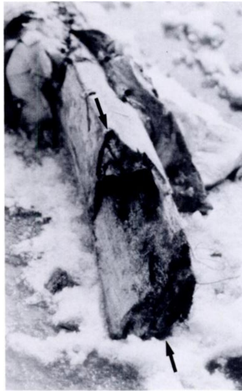
FIGURE 3. Distal fragment of the fractured right mandible of a female bowhead whale. Arrows indicate fracture site. Note the absence of a callus.

mandibular fractures. None has been documented in the literature, and this fracture is the first of any type that we have seen in over 100 harvested bowhead whales.