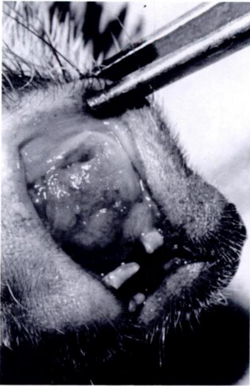
FIGURE 2. Oronasal squamous cell carcinoma protruding into the oral cavity from the maxilla and hard palate of a hedgehog.

tissue. These cells had abundant eosinophilic cytoplasm which, in many cells, was partially keratinized. Nuclei were round to oval and vesicular with one or two prominent nucleoli. Mitoses were infrequent (Fig. 4). Retropharyngeal lymph nodes were infiltrated by neutrophils (suppurative lymphadenitis), but there was no metastatic carcinoma. Additional findings were bilateral adrenal cortical hyperplasia and splenic extramedullary hematopoiesis.