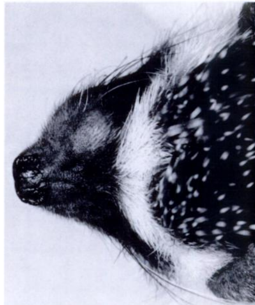
FIGURE 1. Swelling of the right maxilla due to an oronasal squamous cell carcinoma in a hedgehog. The nose was deviated to the left.

Histologically, the mass was a squamous cell carcinoma. In one section of maxilla, the squamous cell carcinoma had isolated the root of an incisor. The neoplastic epithelial cells were well differentiated and formed irregularly branching cords and nests within abundant fibrous connective