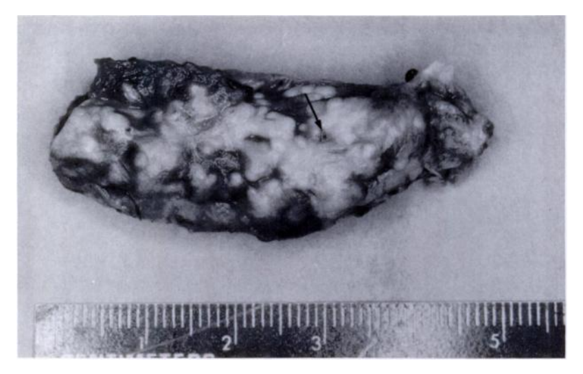
FIGURE 1. White nodules (granulomas) containing larval Spiroxys contorta (arrow) in stomach of Apalone spinifera pallida.