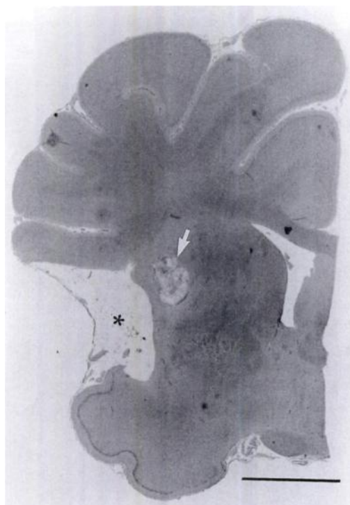
FIGURE 2. Brain section of a raccoon (case 1) showing focal area devoid of brain parenchyma (*). This is an ischemic focus. Subjacent to the ischemic area is an aggregate of macrophages and cholesterol clefts (arrow). H&E stain. Bar = 1 cm.

Case 2: In November 1992, an adult female raccoon in Del Haven, New Jersey