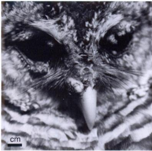
FIGURE 1. Multiple raised pox lesions on the eyelids and cere of a barred owl ( Strix varia ) (Case 3).

tion of the owl, there were multiple raised lesions 2 to 3 mm in diameter associated with ulceration on both feet and one similar lesion on the left naris.