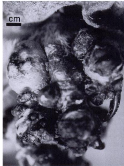
FIGURE 2. Pox lesions on the foot of a barred owl ( Strix varia ) (Case 3).

Case 3, was a juvenile, 664-g barred owl of unknown sex presented to the VMTH on 31 August 1995 because of probable pox lesions. The owl had been housed at a rehabilitation center in Silver Springs, Florida (29°13'N, 82°4'W) since 1 May 1995 when it had been admitted as an orphaned fledgling. On 31 July 1995 the referring veterinarian had noted lesions on both eyelids, the third eyelids, and feet. Two other rehabilitated barred owls housed with this bird had no lesions and were released to the wild at this time. Over the next 30 days the owl was treated with oral enrofloxacin (Mobay Corporation Animal Health Division, Shawnee, Kansas,