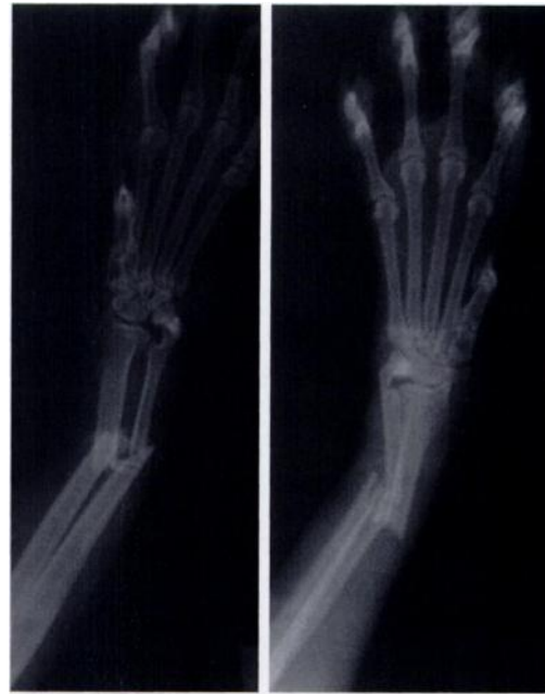
FIGURE 1. Radiograph of the left radius and ulna of a Canada lynx. Lateral and dorsoventral views show the fracture site.

Radiographic examination from dorsoventral and lateral views confirmed a closed, complete, non-comminuted, transverse fracture of the radius and ulna approximately 6 cm from the radial carpal joint (Fig. 1). The animal was placed in right lateral recumbency, and the left forelimb was shaved and prepared for aseptic surgery. An anterior approach was used to access the radial fracture. A 15 cm incision was made to expose the fracture site. Soft tissue and vascular damage in the area appeared to be minimal. A DCP plate (87 mm \times 12 mm; Aesculap Instruments, San