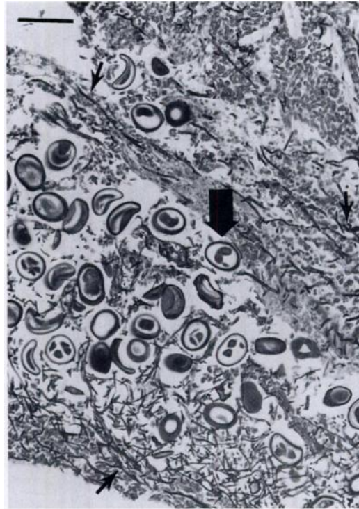
FIGURE 2. Larvated Diplotriaena tricuspidis eggs (large arrow) mixed with abundant Aspergillus fumigatus hyphae (small arrows) in the lung of a blue jay. Grocott's methenamine silver stain. Bar = 100 \mu\text{m} .

Cultures of lung and air sac lesions produced pure growth of A. fumigatus . Several nematodes were cleared in 60% lacto-phenol solution with fast green and identified as D. tricuspidis according to the description of Anderson (1959). Representative specimens were deposited in the U.S. National