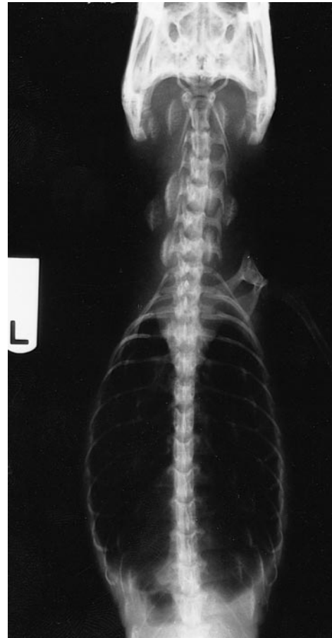
FIGURE 4. Radiograph of subadult Morelet's crocodile from Belize (dorsal view). Note absence of the left forelimb including the scapula and procoracoid.

Survival among Morelet's crocodile hatchlings is generally low (11%) (Platt,