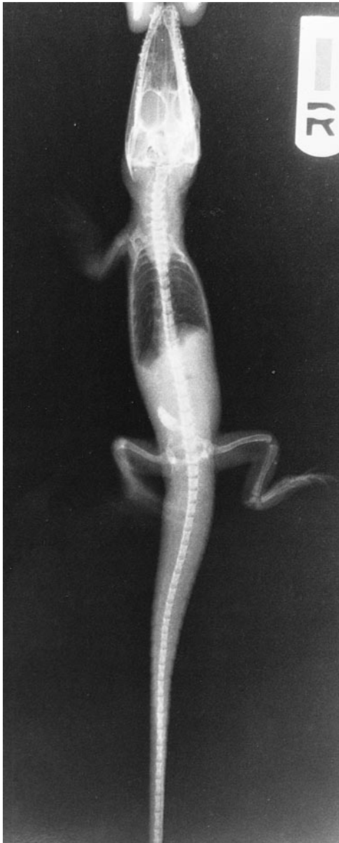
FIGURE 3. Radiograph of juvenile Morelet's crocodile from Belize (ventral view). Note absence of the right forelimb including the scapula and procoracoid.

the fish diet (Ferguson, 1989). Other possibilities include extreme temperatures and humidity in nests during incubation (Ferguson, 1985) and exposure to environmental contaminants, particularly pesticides (Guillette et al., 1994).