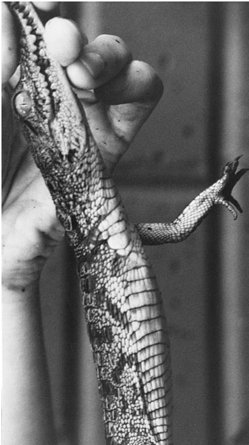
FIGURE 1. Juvenile Morelet's crocodile from Belize missing the right forelimb.

tive of limb loss due to trauma (e.g., bite wound; Figs. 1, 2).