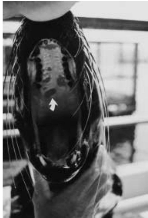
FIGURE 2. Clinical appearance of California sea lion with erupted oral vesicles on hard palate (arrow).

On 8 April 1997 one of the group animals, NIC, was brought to the attention of the veterinary staff with the complaint of poor appetite and reluctance to perform learned behaviors. The following day an erupted vesicle was noted on the sea lion's tongue and calicivirus infection was suspected. Whole blood and serum samples were collected with the animal restrained in a squeeze cage. Amoxicillin (SmithKline Beecham Pharmaceuticals, Philadelphia, Pennsylvania, USA) at 15 mg/kg and clindamycin (The Upjohn Company, Kalamazoo, Michigan, USA) at 12 mg/kg orally, twice daily, were prescribed. On 12 April this animal subsequently developed multiple vesicles of the hard palate and dorsal surface of the tongue, which were causing obvious discomfort (Figs. 1, 2). The animal stayed out of the water with mouth open and refused all fish offered. Topi-