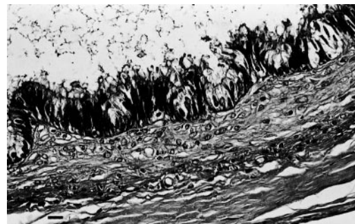
FIGURE 2. Pseudostratified columnar epithelium of the epididymal cyst from a 2 yr old bull. HE. Bar=10 μm.