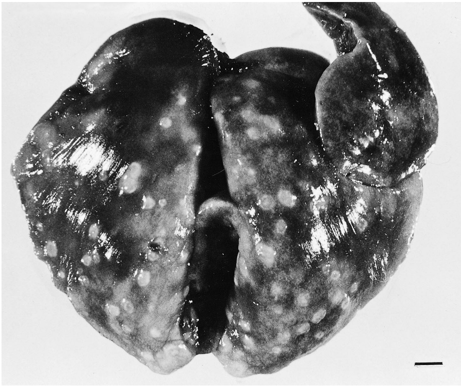
FIGURE 1. Lungs from a high dose M. bovis aerosol-inoculated opossum at 60 days post inoculation (PI). The lungs have dozens of scattered pale granulomas typical of pulmonary tuberculosis. Bar=1 cm.