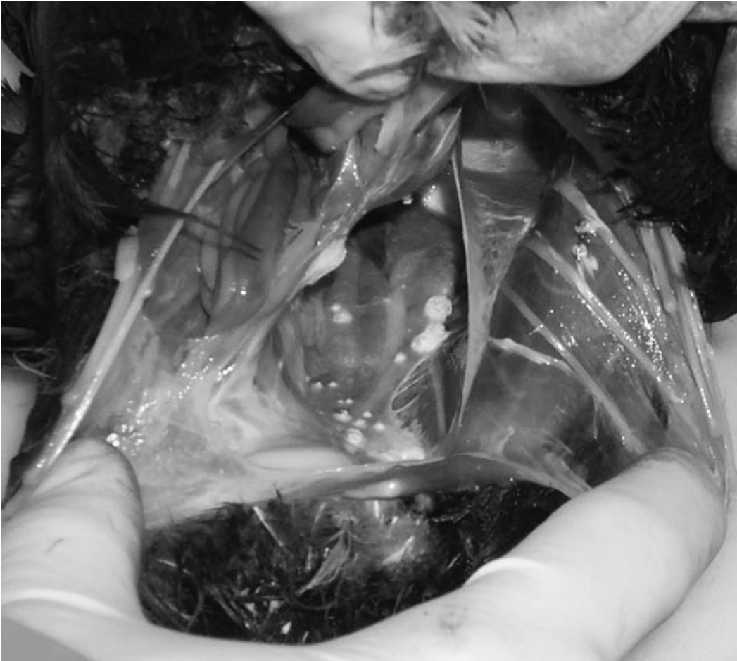
FIGURE 4. Guillemot. Disseminated aspergillosis characterized by multiple small and whitish fungal plaques.

tential age-related susceptibility must be interpreted with caution.