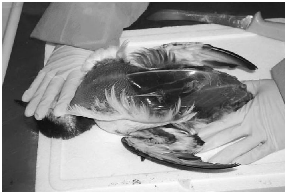
FIGURE 1. Cachectic common murre with severe atrophy of the pectoral muscles and absence of subcutaneous fat.

Microscopically, hepatocytes and Kupfer cells contained brown pigment consistent with hemosiderin, as demonstrated by Perl's Prussian blue stain (Fig. 2). Deposits