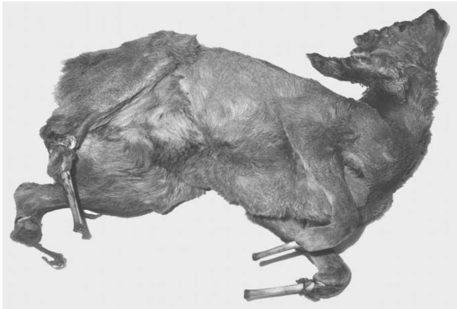
FIGURE 4. Roe deer (no. 11) showing loss of all digits and the naked metacarpal/metatarsal bone shafts with disintegrated skin and muscles advancing up to the proximal third (the left metatarsal bone had fractured during transportation and is not seen on this photograph). Wear, erosion, and discoloration are seen on the bone ends.

is difficult to confirm, especially in free-living animals that are not normally seen until lesions are in an advanced state, long after the toxic insult has ceased. The differential diagnoses would include conditions such as trauma, accidental ligation of the appendages, bacterial infections, and the effects of cold. In nine of the reported cases, there were multifocal lesions, indicating systemic vasoconstriction that was not consistent with trauma or ligation. There also were no indications of a primary bacterial infection. Both roe deer and especially moose are well adapted to the cold climate found in northern latitudes, making frostbite an unlikely cause. However, it should be kept in mind that low temperatures during late autumn and winter may have exacerbated the circulatory disturbances and the loss of extremities in these animals. Low environmental temperatures have been suspected to exacerbate clinical signs of gangrenous ergotism in domestic ruminants (Woods et al., 1966).