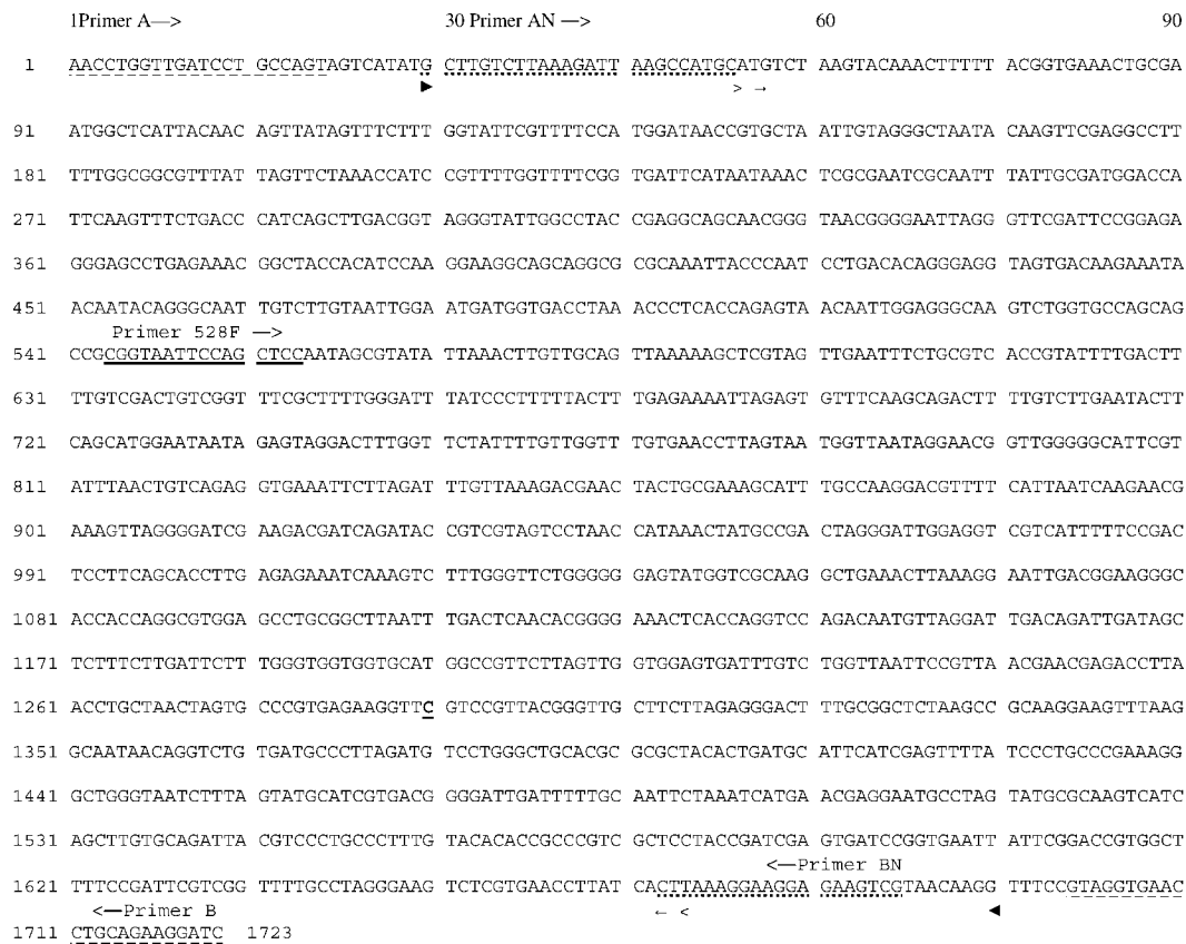
FIGURE 1. Babesia odocoilei small subunit ribosomal RNA (SSU rRNA) gene sequence with denotation of oligonucleotide primer sequences and positions. The SSU rRNA gene sequence from the Pennsylvania (PA) and New York (NY) reindeer and from Minnesota (MN) musk ox 2 isolates is identical to the gene sequence of B. odocoilei (GenBank accession no. U16369). The SSU rRNA gene fragment sequence for the MN musk oxen 3 and 4 isolates begins at position 30 and ends at position 1,687 (▶, ◀). The New Hampshire (NH) elk isolate sequence begins at position 55 and ends at position 1,662 (>, <). The California (CA) bighorn sheep and MN musk ox 1 isolate sequences begin at position 56 and end at position 1,660 (→, ←). All sequences were identical to that of U16369 except for a single base substitution in the CA bighorn sheep isolate sequence (thymidine for a cytosine at position 1,290; bold type, underlined). The positions of primers A and B are indicated by broken underlining, of primers AN and BN by dotted underlining, and of 528F by bold underlining. Primer orientation is indicated by arrows.

created using the ClustalW 1.8 Program ( http://searchlauncher.bcm.tmc.edu/multi-align/multi-align.html ).