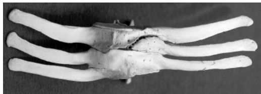
FIGURE 3. Ventral view of fused 11th, 12th, and 13th lumbar vertebrae of striped dolphin ( Stenella coeruleoalba ) from the Adriatic Sea. Old pathologic changes (osteolysis, fusion of vertebral bodies and deviation of vertebral canal) that might be because of previous localized osteomyelitis caused by C. tertium strain Zagreb are clearly visible. Bar=5 cm.

conditions. A Gram's-stained smear of granules from specimens both revealed large gram-positive rods with large, oval, terminally placed spores. After 24 hr incubation under aerobic and anaerobic conditions, a pure culture of opaque, medium-size colonies were recovered. Although cultures of C. tertium often present as gram-negative, especially when cultured under aerobic conditions (Lew et al., 1990), both the aerobic and anaerobic cultures from this striped dolphin were clearly identified as gram-positive non-sporulating rods. Identification of colonies was carried out according to procedure described by Quinn et al. (1994), and using API20 A (bio-Mérieux, Marcy-l'Etoile, France), the isolate was identified as C. tertium with a probability of 99.9%.