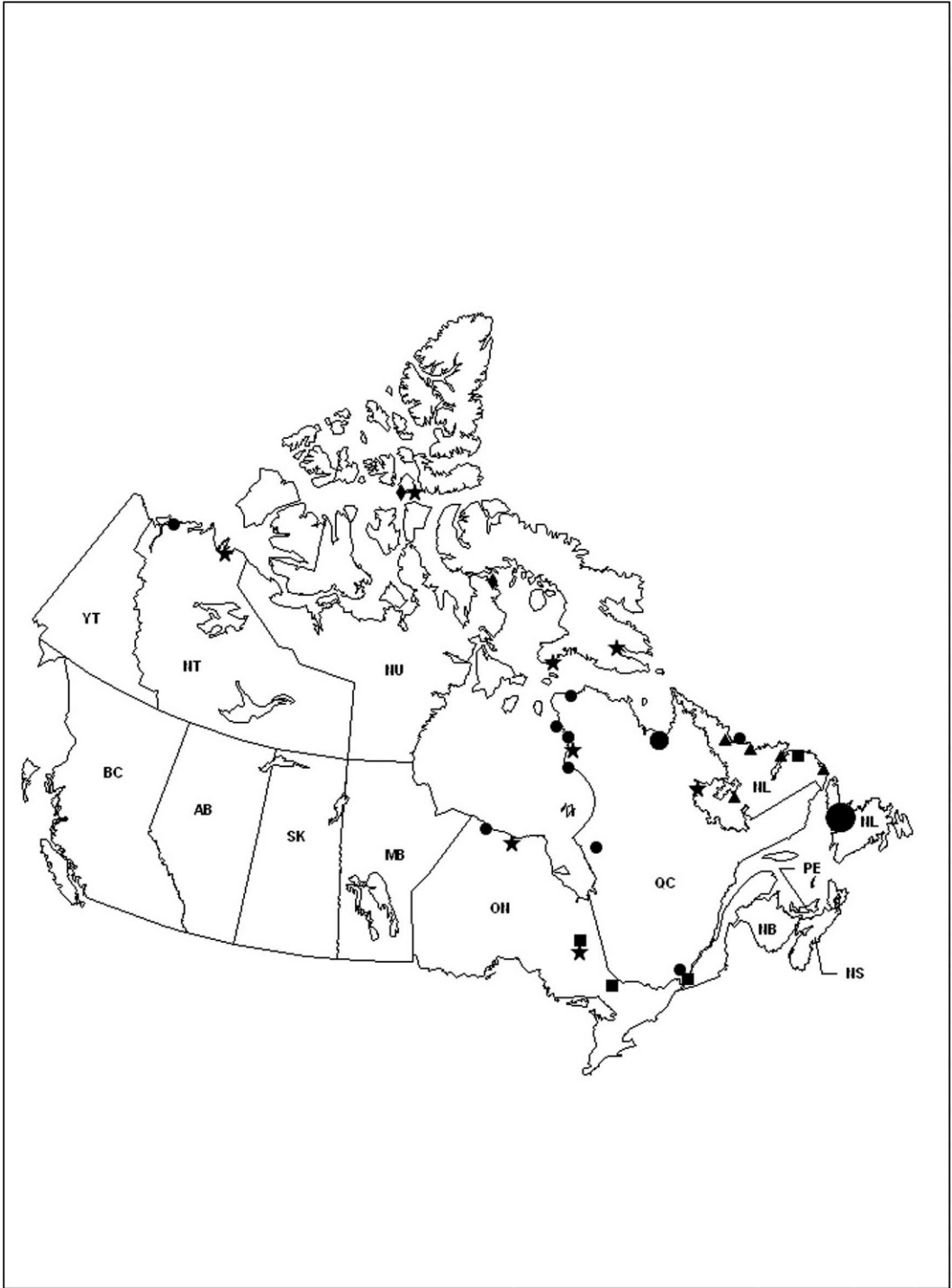
FIGURE 3. Map of Canada showing the geographical distribution of samples employed in these studies according to their phylogenetic groupings thus: ▲, clade A; ●, clade B; ■, clade C; ◆, clade D; ★, unclassified. Standard size symbols represent single specimens, intermediate size symbols represent 3–5 specimens, and the large circle represents >10 specimens. Province/territory names are shown by their two-letter abbreviations: AB, Alberta; BC, British Columbia; MB, Manitoba; NB, New Brunswick; NL, Newfoundland and Labrador; NS, Nova Scotia; NT, North West Territories; NU, Nunavut; ON, Ontario; PE, Prince Edward Island; QC, Quebec; SK, Saskatchewan; YT, Yukon Territory.