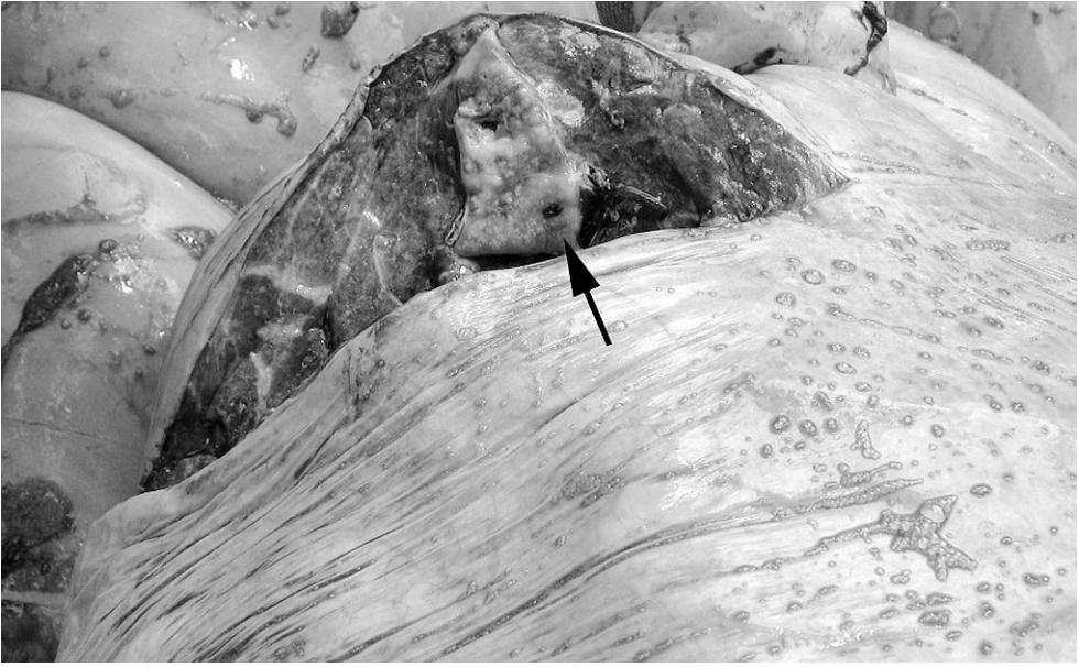
FIGURE 1. A transverse cut through an unencapsulated tuberculosis granuloma in the dorsocaudal lobe of the left lung, ~40 mm in diameter. Bar=1.5 cm.