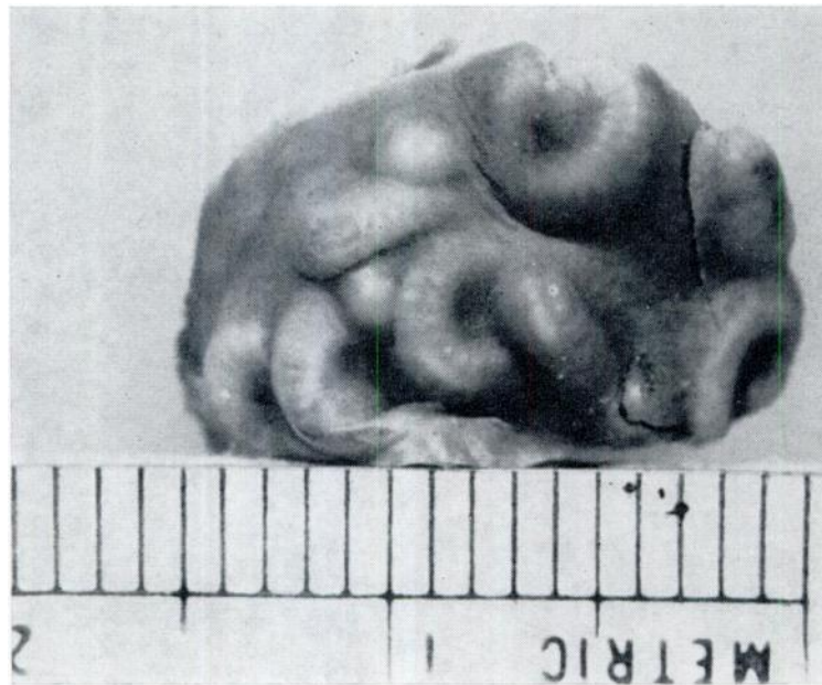
FIGURE 1. Portion of ferret-badger liver with encysted larvae of Armillifer sp.