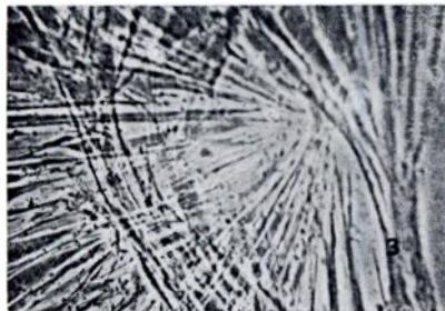
FIGURE 3. Cells from lung of gray seal — 2 months in culture.