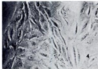
FIGURE 4. Cells from kidney of gray seal — epithelial-like and possibly transformed.