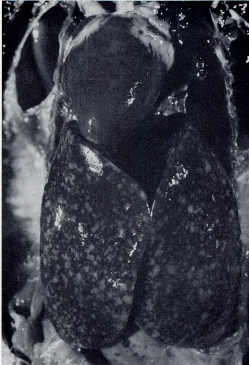
FIGURE 1. Photograph of the liver of a juvenile male prairie falcon with inclusion body hepatitis. Disseminated necrotic foci appear as pale dots on the surface of the liver.