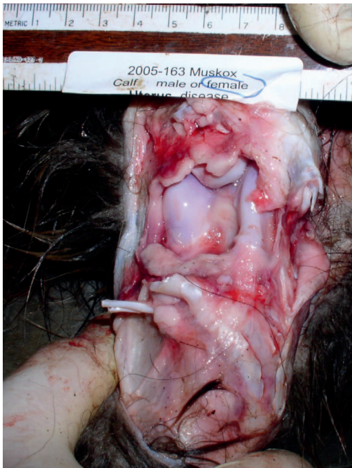
FIGURE 3. Synovitis positive for Chlamydophila sp. on immunohistochemistry staining, in a swollen hock joint of a copper-deficient muskox ( Ovibos moschatus ) calf that displayed lameness before euthanasia. Ruler in centimeters.

was low in ENS and was only detected during the decline period. Antibodies against Brucella suis serovar 4 and bovine viral diarrhea virus were detected in ENS only during the decline period, but not from WA during either period. Coxiella burnetii was detected at low prevalence from both areas during the decline period. Because of specimen availability and funding sources, only archived sera were tested for CE, and antibodies were detected in ENS but not from WA.