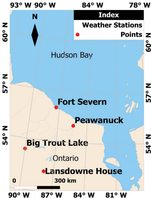
FIGURE 1. The study area—the Hudson Bay Lowlands of northern Ontario, Canada.

Tam (2009) identified the location of palsas in the Peawanuck area and further south, and within 20 km south of Fort Severn. Two of the authors (Kowal and Xie) observed palsas in an aerial survey during the summer of 2011 (54°12'N, 88°54'W), 80 km northeast of Big Trout Lake. As reported by Tam (2009), this cross section of palsas is part of a wide band of palsas extending from the Manitoba border to James Bay. Big Trout Lake is 314 km southwest of Peawanuck and 290 km south-southwest of Fort Severn. Since the Big Trout Lake/Fort Severn transect is roughly perpendicular to the palsa band, the palsa band is estimated to be just over 220 km in width.