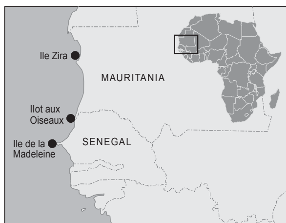
Figure 1. Map of the Atlantic coast of Mauritania and Senegal showing locations (black dots) where pellets of White-breasted Cormorants were collected in the period 2001–2005.

the Senegal River. The foraging area of the cormorants of this roosting site is unknown. The most likely feeding grounds are the nearby ocean, in brackish and fresh water in the river and in freshwater bodies (river, flood plains, lakes and marshes) situated upstream along the river. (3) On 28 November 2001, 49 pellets were collected in a breeding colony with active nests on a rocky island of the National Park ‘Iles de la Madeleine’ situated 2.5 km west of Dakar, Senegal. The cormorants breeding on Ile de la Madeleine are assumed to find their food exclusively in the surrounding ocean as freshwater bodies providing feeding possibilities hardly exist within the foraging range of the species.