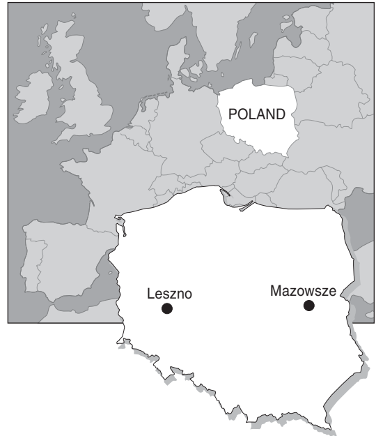
Figure 1. Location of the two main study plots in Poland.

Fieldwork was conducted in the breeding seasons 1996–2005 near Leszno in western Poland (Fig. 1), which has typical breeding densities of the Red-backed Shrike in Poland: c. 4.7 breeding pairs/km 2 (Kuźniak & Tryjanowski 2000, and unpublished data). In total the study area covered c. 20 km 2 . Between 1998 and 2003 another study plot (9 km 2 ) was established in farmland at Mazowsze in the Mazovian Lowland (central eastern Poland). With a density up to 19 breeding pairs/km 2 the Red-backed Shrike was among the most numerous species at this location (more details in Gołowski 2006). Detected nests were checked regularly but due to the adverse human impact of disturbance on nest success (Tryjanowski & Kuźniak 1999) only 1–5 visits (depending on nest searching time) were done, every 4–5 days. At the appropriate age nestlings were ringed. A total of 122 adults and 1245 nestlings (122 adults and 861 nestlings in Leszno, 384 nestlings in Mazowsze) were ringed between 1996 and 2005. The number of investigated breeding pairs per season varied between 42 and 96. Adult birds were trapped and re-trapped by means of mist-nests and bowl-traps with a cricket inserted as a lure. Adults and nestlings were provided with numbered aluminium rings (Ringing Centre, Department of Ornithology PAS, Poland, ring series J) and some were also ringed by a combination of colour rings (33 males and 31 females in 1997–1999). This enabled easy identification of individuals by visual observation. If we