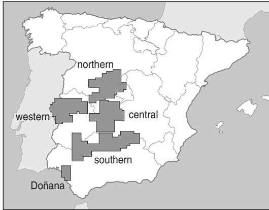
Figure 1. Outline of Spanish Imperial Eagle populations considered in the present study.

age-class of the birds based on their plumages (González 1991, González et al. 2008). Individuals in adult plumage (age class >5.5 years old) and in subadult plumage (age class 4.5–5.5 years old, because most of these individuals reproduced, unlike younger age classes) were considered to be adults and individuals in the age-classes of 1.0–4.5 years were considered non-adults . In order to detect the formation of new pairs, we monitored peripheral areas adjacent to the nuclei with potential habitat for the species on an annual basis (González et al. 2006, González et al. 2008).