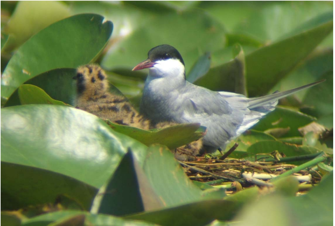
Figure 1. Whiskered tern with chicks on nest within White Waterlily beds in Lake Grand-Lieu, France.

back. As hatching is synchronous within a clutch (Cramp 1985, pers. obs.), we suppose that hatching dates were correctly assigned for all chicks ( n = 33 ). The day of hatching was denoted as day 0, and the average value of chick age at first encounter was 1.2 \text{ days} \pm 0.2 \text{ SE} (range: 0–3 days, n = 33 chicks). Within the enclosures, at first encounter all chicks were marked with a paint mark on their heads, and then ringed within 4.9 \text{ days} \pm 0.3 \text{ SE} (range: 2–8 days, n = 33 chicks) from hatching with a metal ring provided by the CRBPO. Each chick was weighed to the nearest 0.1 g using an electronic balance. The tarsus and culmen (from the tip of the bill to the base of the feathers) lengths were measured with a Vernier calliper to the nearest 0.1 mm, and the wing length (from the carpal joint to the top of the wing) was measured to the nearest 1 mm using a