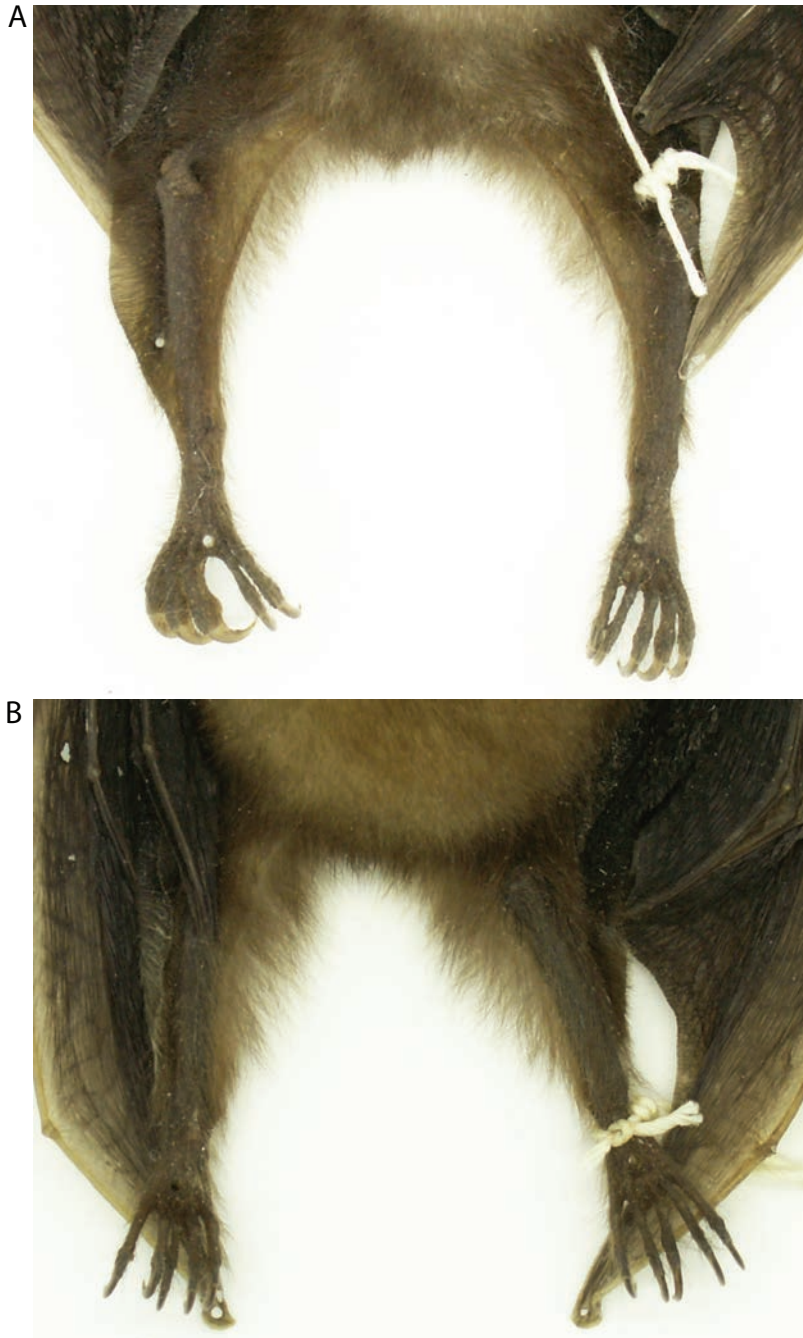
FIG. 5. Dorsal views of the uropatagium and legs in A , Sturnira giannae (FMNH 203590) and B , S. lilium (AMNH 205180) illustrating taxonomic differences in the degree of hairiness. In S. giannae , the trailing edge of the uropatagium is covered by short hairs (4–6 mm) and the dorsal surfaces of the tibia and feet are sparsely covered with long hairs. In S. lilium , the uropatagium is covered by long hairs (7–9 mm) and the tibia and feet are densely covered with long hairs.