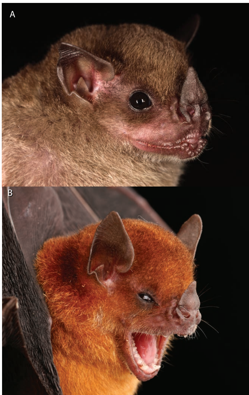
FIG. 4. Photographs of A , an adult male (ROM F63353) and B , an adult female (ROM 117574) Sturnira giannae captured at the Estación Biológica “José Álvarez Alonso,” Reserva Nacional Allpahuayo-Mishana, Loreto, Peru, and Blanche Marie Vallen, Sipaliwini, Suriname, respectively. The two specimens illustrate the two extremes of the fur color variation in the species, with some specimens exhibiting brown fur (A) while others are much more reddish (B).