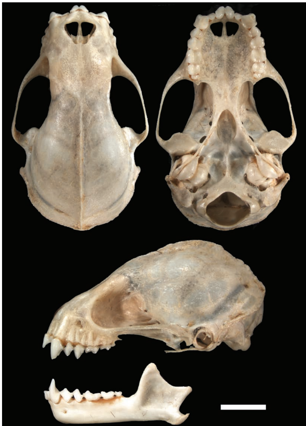
FIG. 2. Dorsal, ventral, and lateral views of the cranium and lateral view of the mandible of Sturnira giannae (AMNH 268545, holotype). Scale bar = 5 mm.