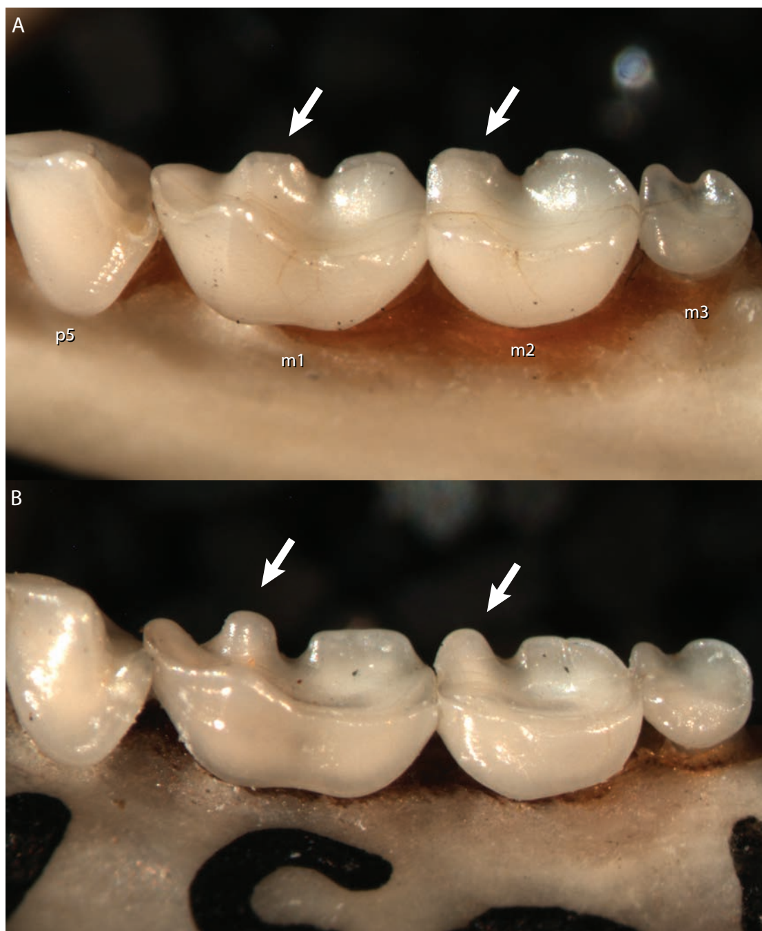
FIG. 7. Dorsolateral views of the left mandibular tooththrows in A , Sturnira giannae (AMNH 268545) and B , S. lilium (AMNH 205180), illustrating taxonomic differences in the shape of the metaconids of m1 and m2. In S. giannae , the metaconids of m1 and m2 are longer mesiodistally (arrows). In S. lilium , however, the metaconids of m1 and m2 are shorter mesiodistally (arrows).