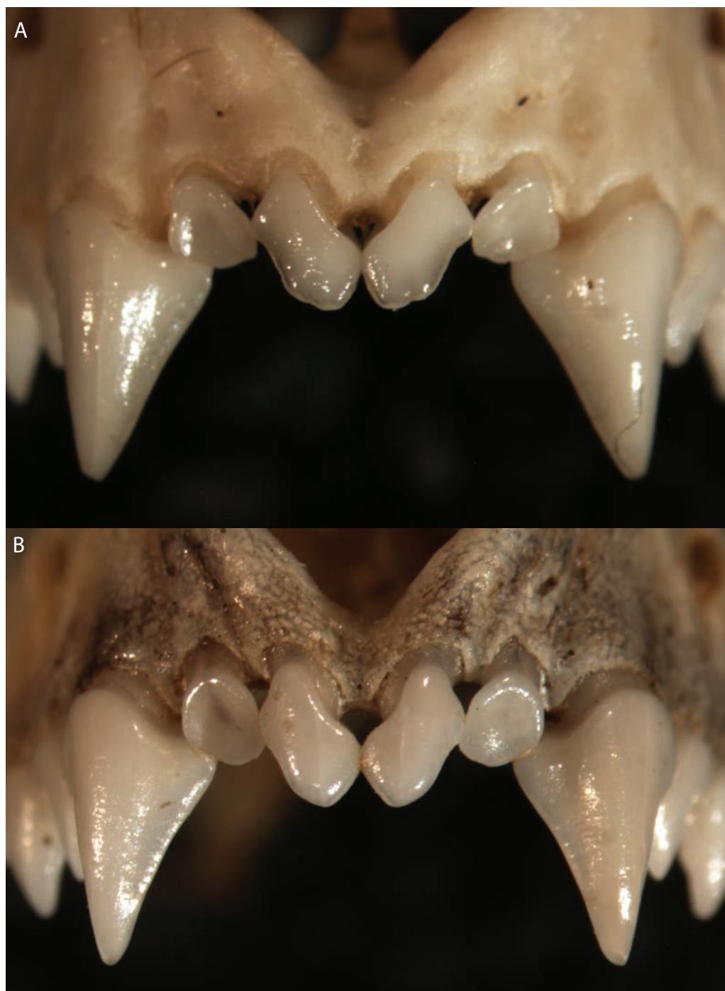
FIG. 6. Anterior views of the upper incisors and canines in A , Sturnira giannae (MUSM 13260) and B , S. lilium (AMNH 185320) illustrating taxonomic differences in the number of cusps of the upper inner incisor (I1). In S. giannae the I1 is bicuspidate while in S. lilium I1 is unicuspidate.