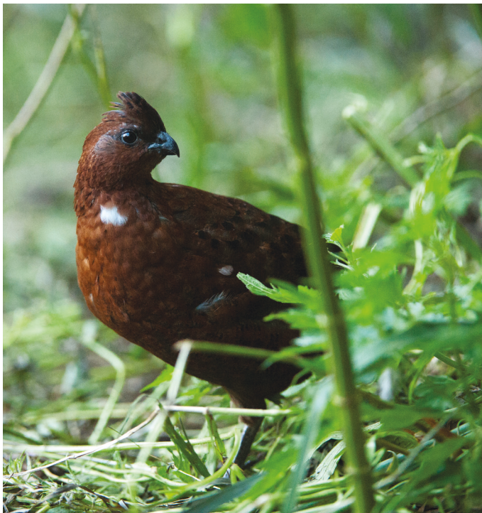
Figure 12. Melanistic form of Northern Bobwhite Colinus virginianus known as 'Tennessee Red'; note the few white feathers (leucism) which often co-occur with certain forms of melanism; see Figs. 10 and 15