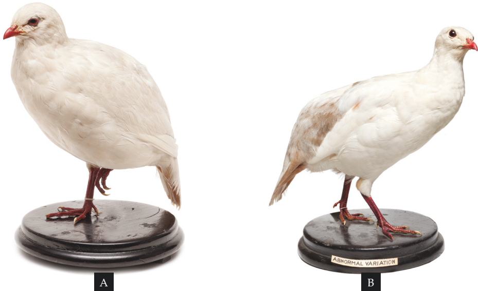
Figure 17. Leucistic Red-legged Partridges Alectoris rufa, collected c.1900 in England. A: NHMUK 1996.41.2098, B: NHMUK 1996.41.414