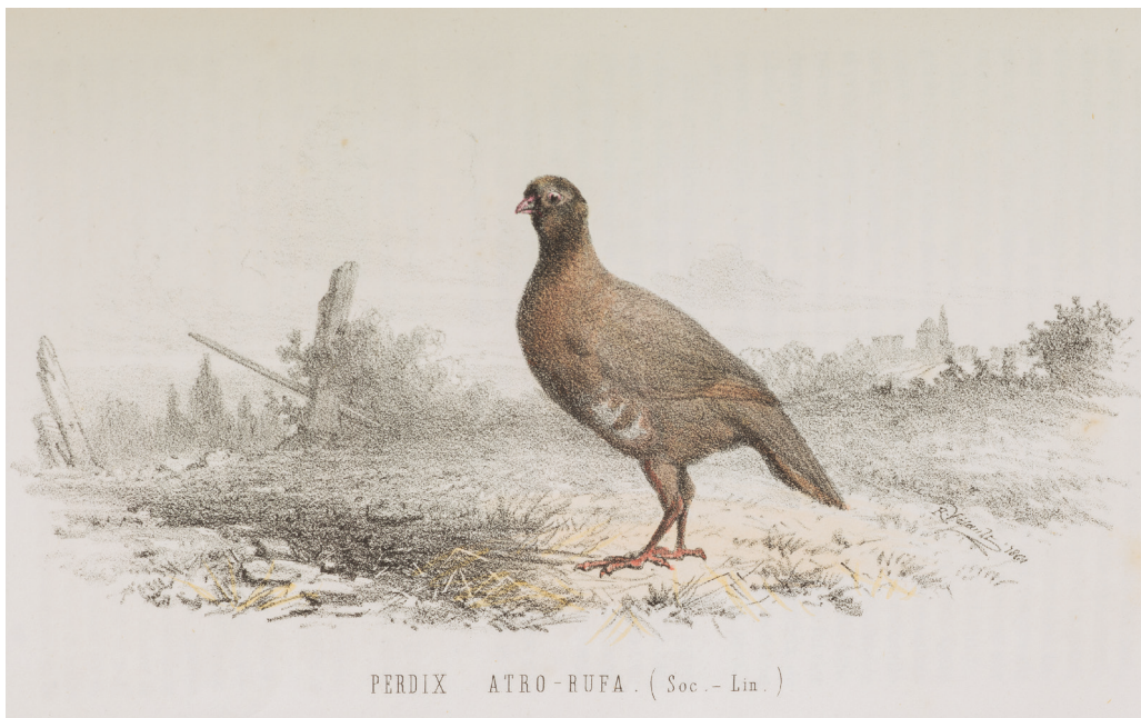
Figure 2. Perdix atro-rufa , the melanistic variety of Red-legged Partridge, described taxonomically by de Soland