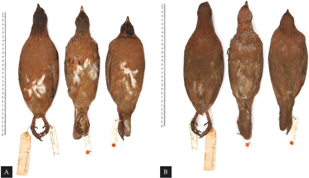
Figure 8. Specimens at the Natural History Museum, Tring. Ventral (A) and dorsal views (B), from left to right NHMUK 1915.1.15.1, 1915.10.5.1 and 1908.10.22.1