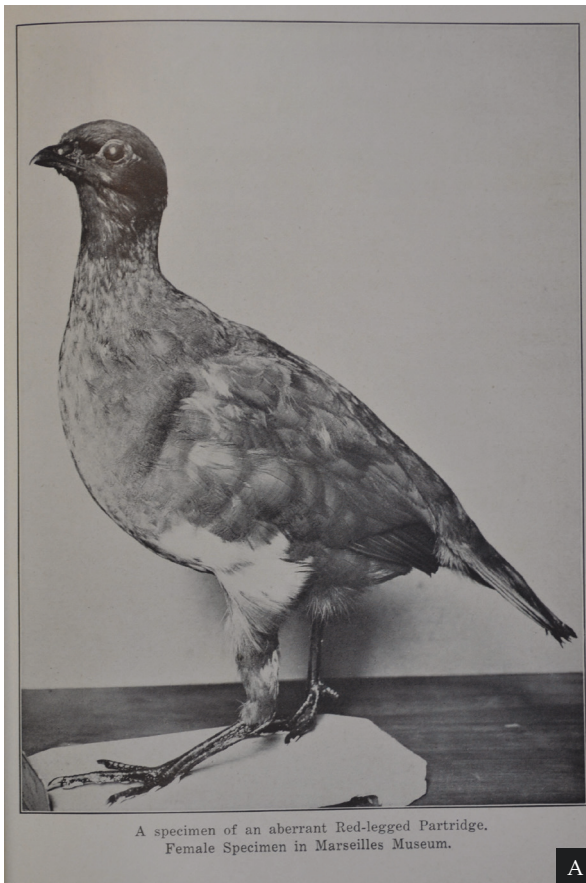
Figure 4. Mounted specimen (MHNM.0.394) at Muséum d'Histoire naturelle de Marseille, originally labelled 'Basses Alpes, France 1844'. A: figured in Hachisuka (1928) (Hein van Grouw). B: photographed in 2016 (Stéphane Jouve, ©Muséum de Marseille)

female, but no evidence of the bird's sex is recorded with the specimen. Until April 1970, 'Basses-Alpes' was the name of the Alpes-de-Haute-Provence, in southern France. If the date and locality are correct, then this specimen was collected before the population in Vendée was discovered, and is probably unrelated genetically.