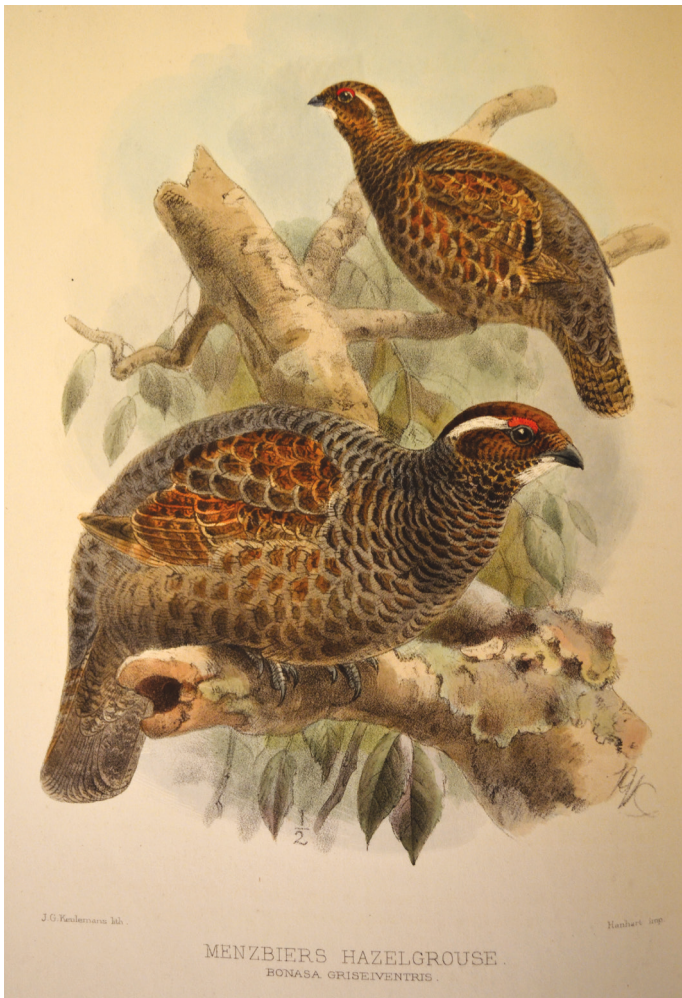
Figure 15. Menzbier's Hazel Grouse Bonasa griseiventris [sic], in Dresser (1896), proved to be a melanistic variety of Hazel Grouse Tetrastes bonasia ; the specimen Dresser selected for the illustration had a small white bib and a few white feathers behind the eye, features which he assumed distinguished the 'species'. However, a few white feathers often co-occur with certain forms of melanism, but are certainly not usual (Hein van Grouw, © Natural History Museum, London)