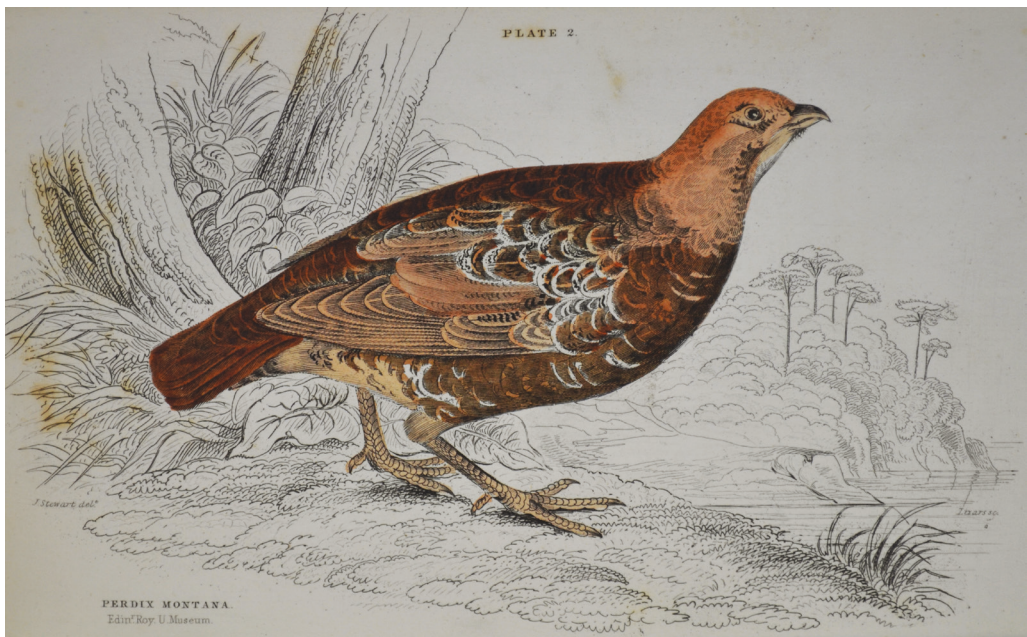
Figure 1. Mountain Partridge Perdix montana . Brisson knew this 'species' only from the mountains of Lotharingen, France, hence montana . However, subsequently ' montana ' was proven to occur all over Europe and to be a melanistic form of Grey Partridge P. perdix . From Sir William Jardine's Naturalist's library , 1834, The natural history of game birds