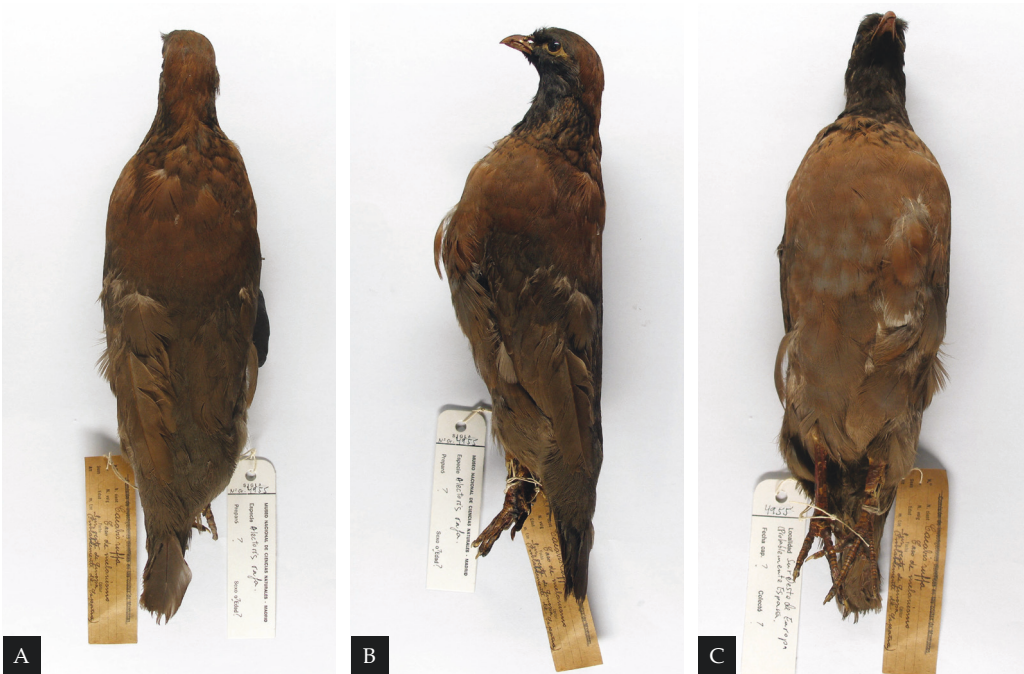
Figure 9. Specimen (relaxed mount, MNCN-A4955) at Museo Nacional de Ciencias Naturales, Madrid, Spain, labelled 'Sur-oeste de Europa, probablemente España'