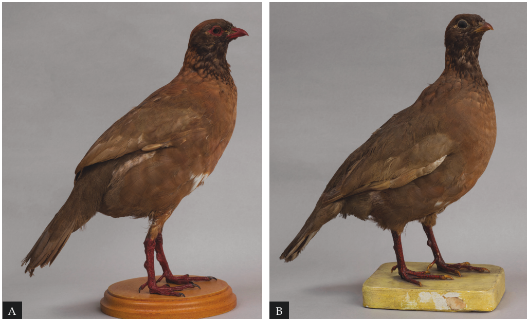
Figure 6. Mounted specimens at Muséum des sciences naturelles d’Angers, France. A: MHN.An.2003.522. B: MHN.An.2003.523

‘Perdrix lugubres, achetée 10 francs’ It is unclear whether 1863 is the date of acquisition, collection or registration. 1863, however, appears to be incorrect for collection or acquisition as, based on de Soland (1861), these specimens must have been present in the museum