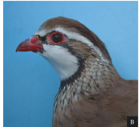
Figure 19. 'Brown' Red-legged Partridge Alectoris rufa , bred and held in captivity

which certainly contributed to their extirpation. Whether the mutation also had negative effects on fitness meaning that a thriving population would never have become established is unknown. Many mutations, however, like 'Leucism', 'Dilution' and 'Brown' (Figs. 17–19), in Red-legged Partridge are widespread in populations and appear repeatedly in the wild. In contrast, the melanistic variety is known only from three localities and for a period of c. 70 years prior to 1915. A possible explanation for the loss of the melanistic variety is that the allele for this mutation has disappeared altogether from Red-legged Partridge populations due to hunting and an influx of genetically unrelated birds.