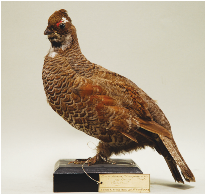
Figure 16. Melanistic specimen of Hazel Grouse Tetrastes bonasia formerly known as T. gryseiventris, in the Zoological Research Museum Alexander Koenig, Bonn