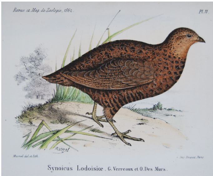
Figure 14. Synoicus lodoisiae , in Verreaux & des Murs (1862), which proved to be a melanistic variety of Common Quail Coturnix coturnix