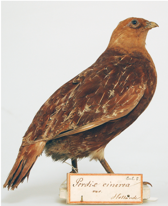
Figure 11. Melanistic form of Grey Partridge Perdix perdix, originally named P. montana, a specimen in the Naturalis Biodiversity Centre, Leiden