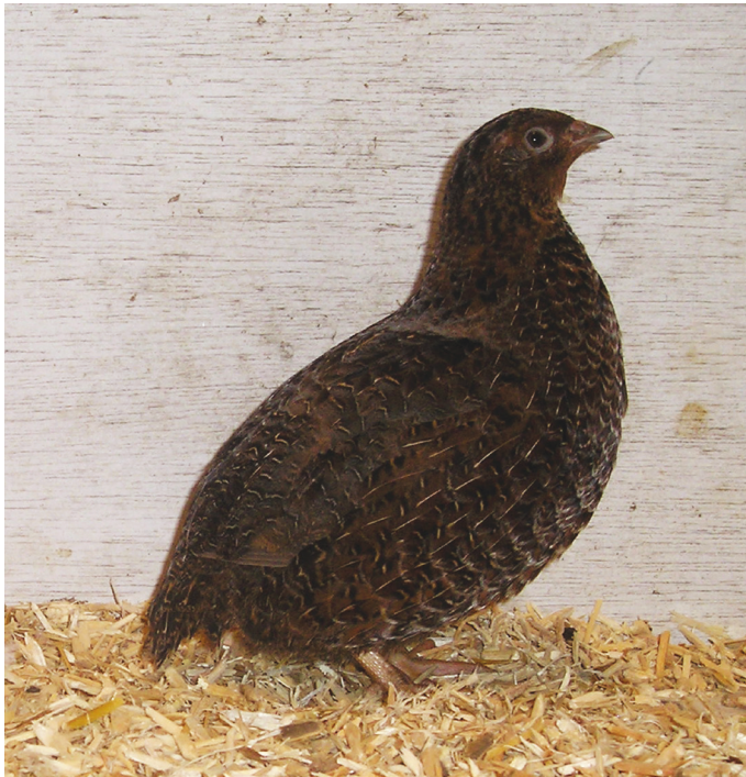
Figure 13. Melanistic form of Japanese Quail Coturnix japonica known as 'recessive black'. Both melanin pigments seem to be equally present in most feathers and the original patterns and markings are faint and therefore this mutation is very much comparable with the melanistic variety known as atro-rufa in Red-legged Partridge Alectoris rufa

japonica , as in the latter, due to the mutation, each feather also contains both pigments and the original patterns and markings are faded (Fig. 13). In appearance, the varieties of both species do not look like each other at all, but in their normal colour the two are also totally different. In comparing mutations within different species, one must examine what happens to the pigmentation process, rather than just comparing the final result, as this can differ between species.