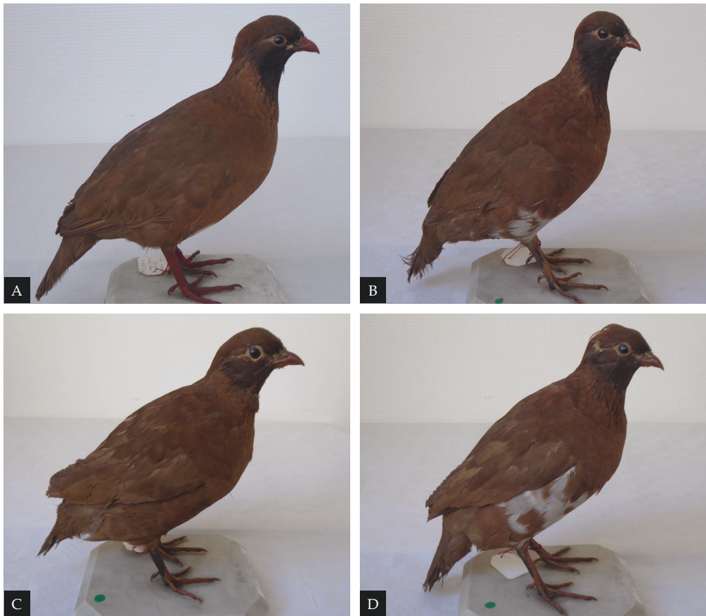
Figure 7. Mounted specimens at Museum de Société des Sciences Lettres et Arts de Cholet et sa région, France. A: SLA274-37.2. B: SLA288-37.6. C: SLA266-37.7. D: SLA265-37.8