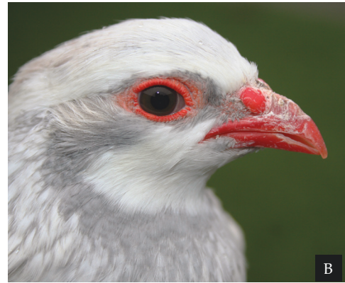
Figure 18. 'Diluted' Red-legged Partridge Alectoris rufa , bred and held in captivity