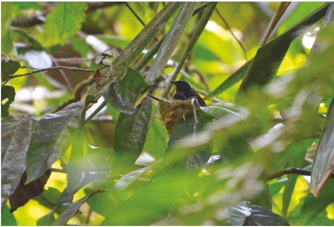
Figure 1. Two nests of Natewa Silktail Lamprolia klinesmithi , Natewa Peninsula, Vanua Levu, Fiji: (a) nest 1 with the adult perched on the rim, (b) nest 3 and (c) the egg in nest 3 shown in the reflection of the mirror