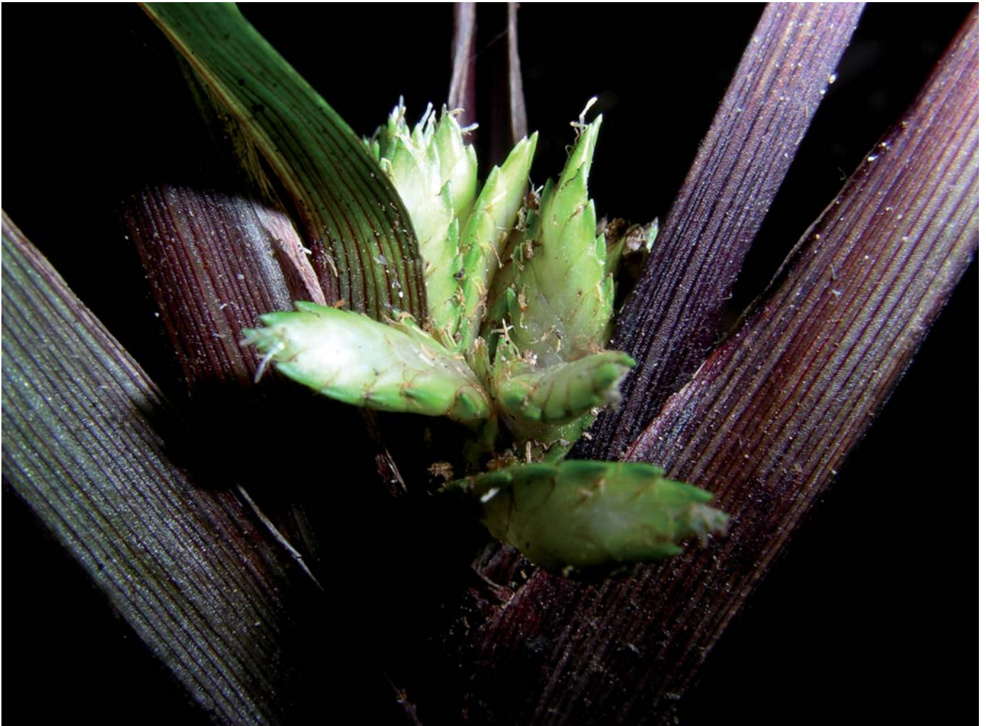
Fig. 2. – Field photograph of Cyperus chamaecephalus Cherm., in Antsahabe forest (Daraina) corresponding to collection Nusbaumer & Ranirison 1294.