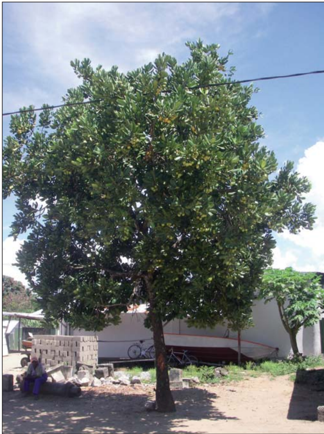
Fig. 4. – A tree of Mimusops coriacea (A. DC.) Miq. preserved in the city of Masoala, Eastern Madagascar.