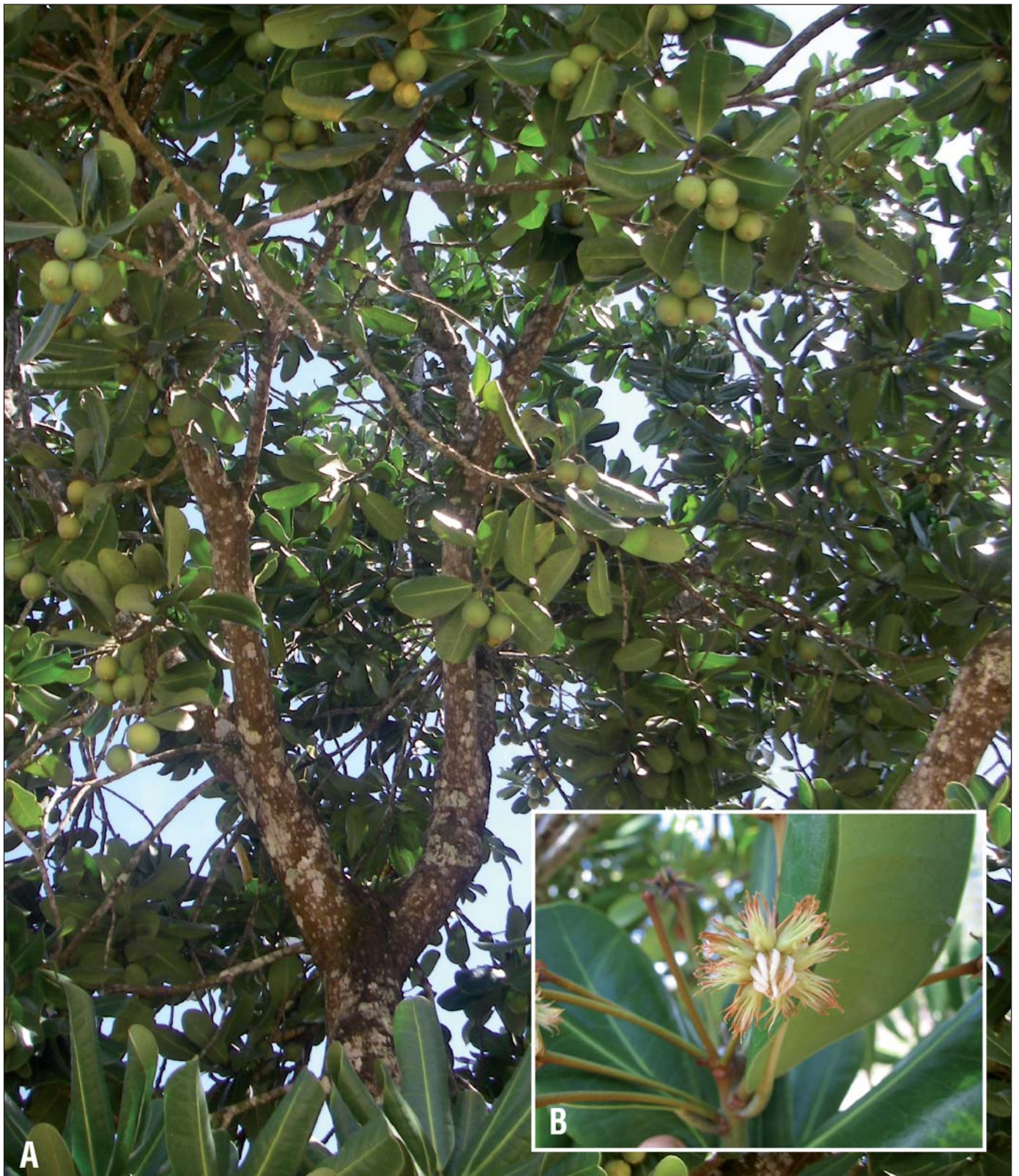
Fig. 1. – Mimosa coriacea (A. DC.) Miq. A. In fruit near Masoala, Eastern Madagascar; B. Flower in Orangea, Antsiranana.