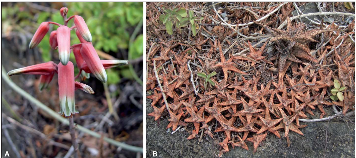
Fig. 3. – Living plant of Aloe fragilis Lavranos & Rösösl at the type locality of Cap Manambato, near Iharaña (Voehemar). A. Inflorescence; B. Leaves.