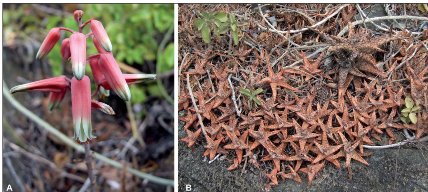
Fig. 3. – Living plant of Aloe fragilis Lavranos & Rösli at the type locality of Cap Manambato, near Iharaña (Vohemar). A. Inflorescence; B. Leaves.