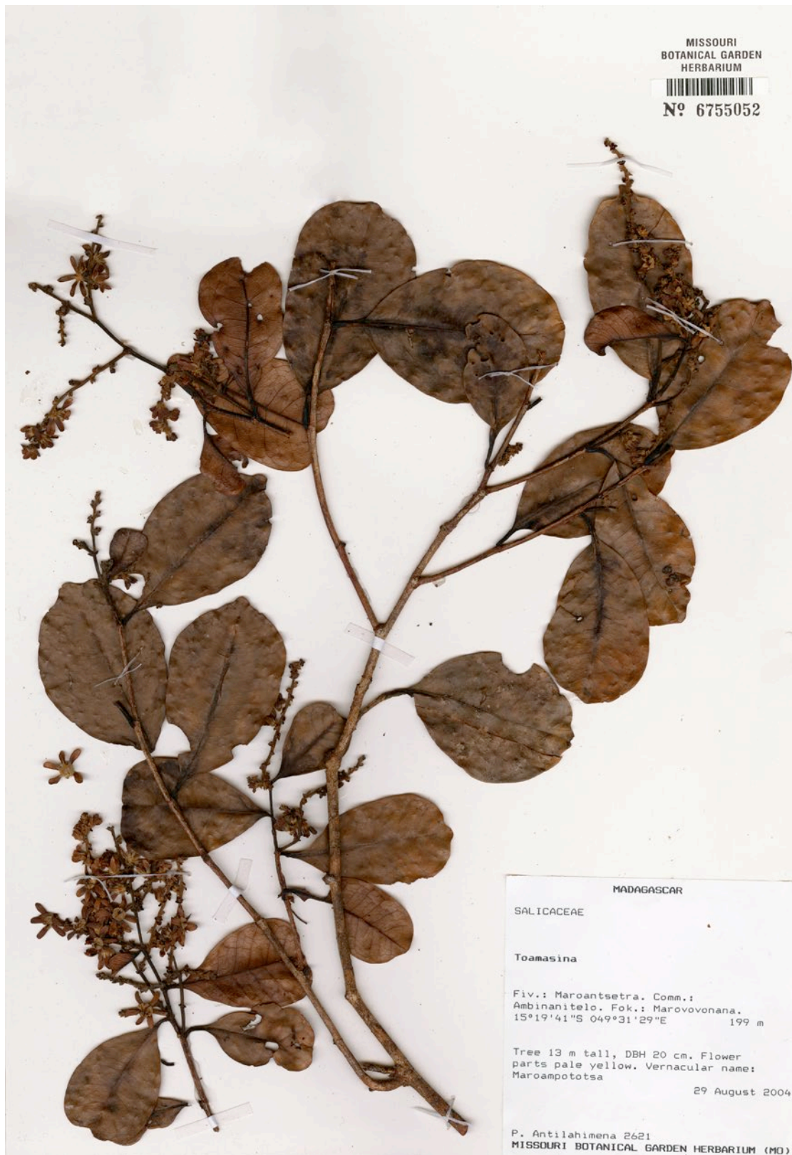
Fig. 2. – Holotype of Homalium antilahimena Wassel & Appleg. [ Antilahimena 2621, MO]