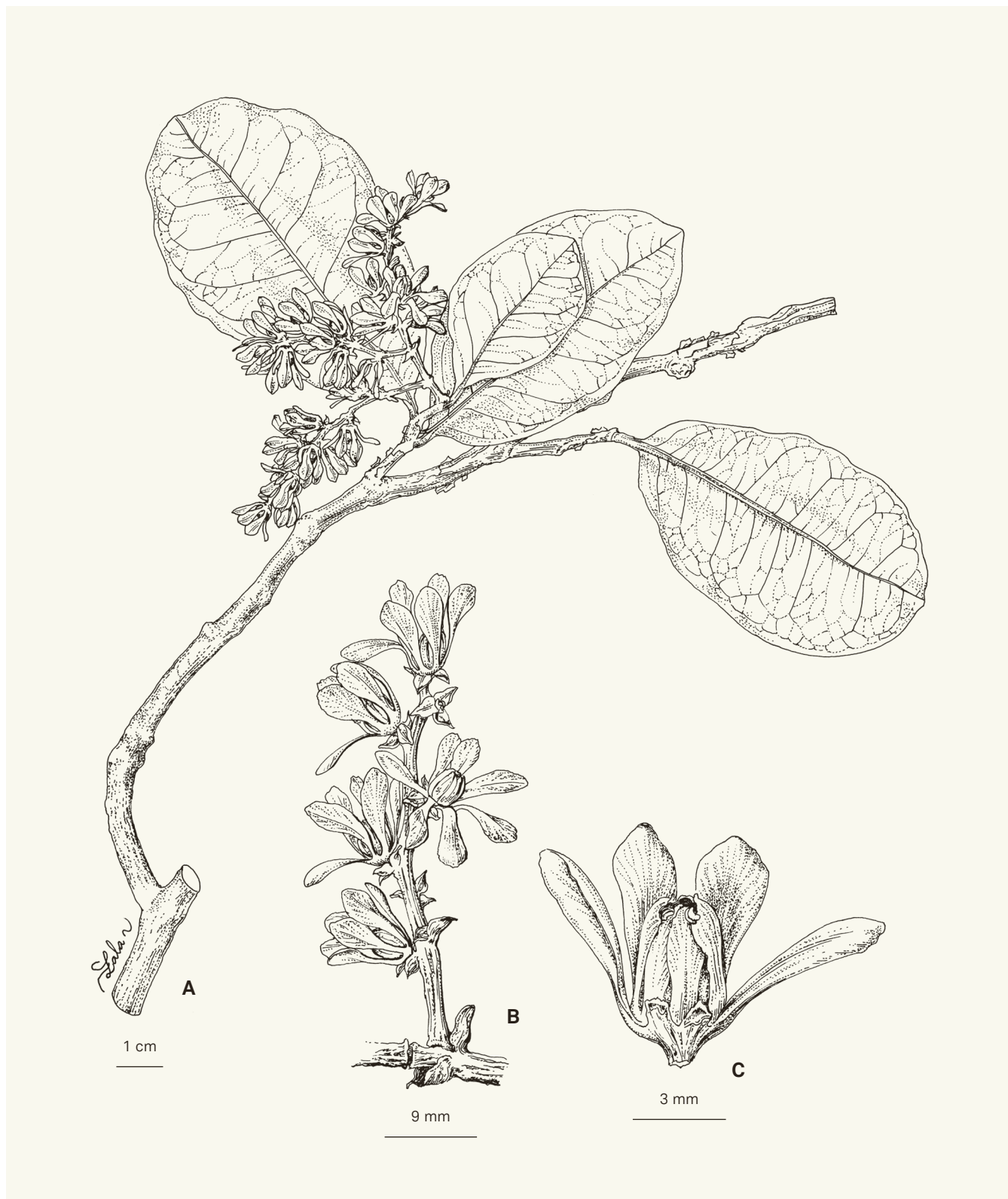
Fig. 5. – Homalium pachycladum Wassel & Appleq. A. Flowering branch; B. Inflorescence; C. Flower post-anthesis. [Antilahimena et al. 1540, TAN] [Drawings: R.L. Andriamiarisoa]