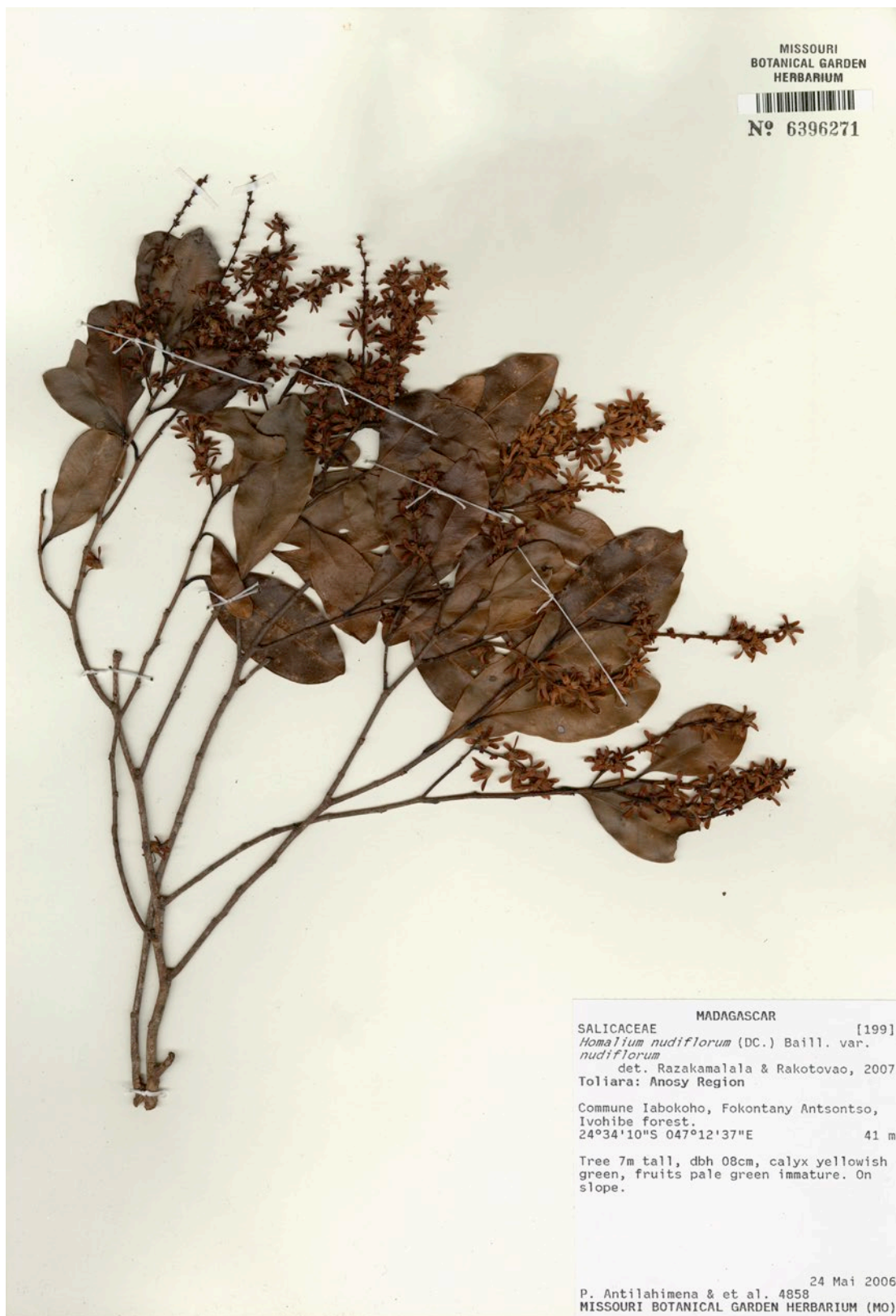
Fig. 7. – Holotype of Homalium tenue Wassel & Appleq. [Antilahimena 4858, MO]