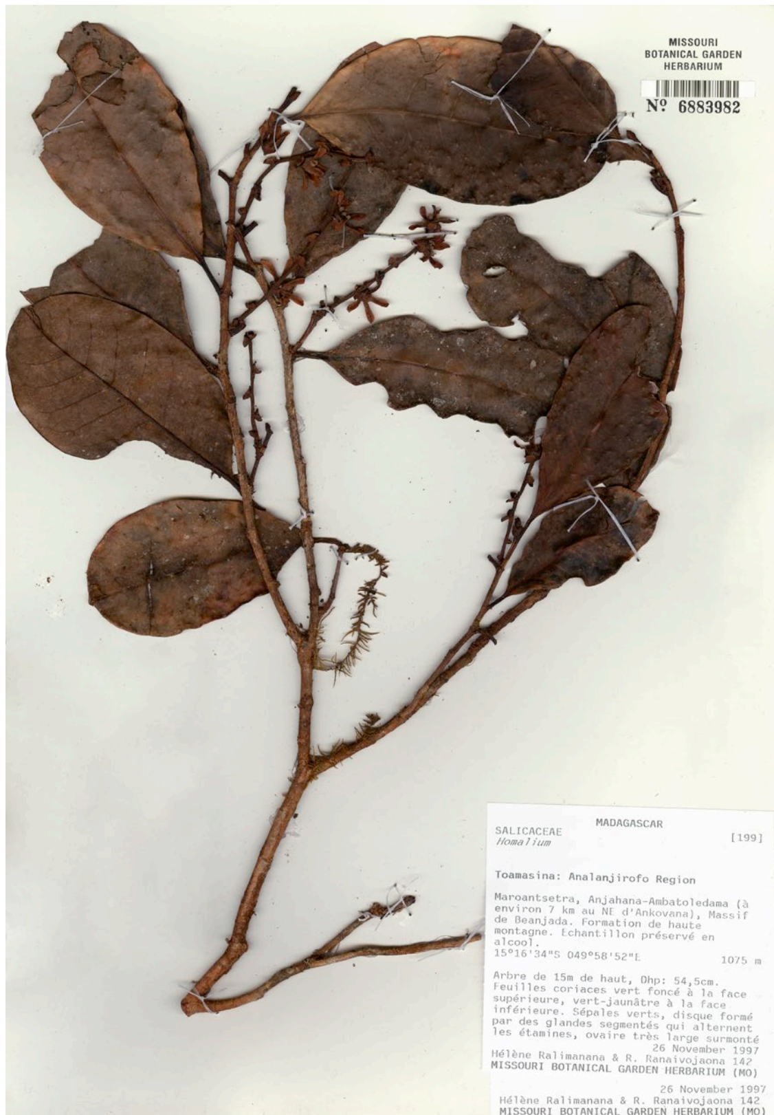
Fig. 6. – Holotype of Homalium stelliferum subsp. andapense Wassel & Appleg. [Ralimanana & Ranaivojaona 142, MO]