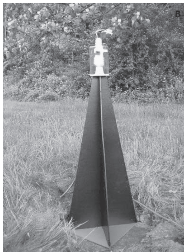
Fig. 1. Standard black pyramid trap with PHER lure (A) and modified pyramid trap with narrow blue fluorescent light (B).