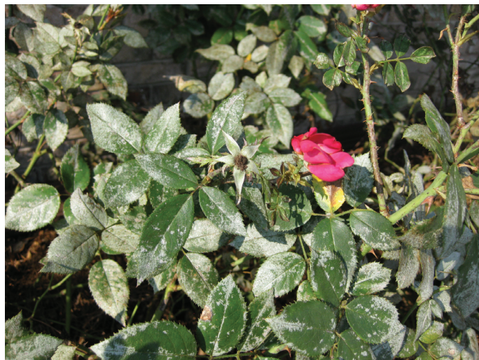
Fig. 1. Injury to the leaves of Rosa species by Selenothrips rubrocinctus , Leon County, Florida, USA.

A bean-dip bioassay method previously developed by Eger et al. (1998) for thrips was used to determine the susceptibility of C. stenopterus and S. rubrocinctus to the insecticides with different modes of