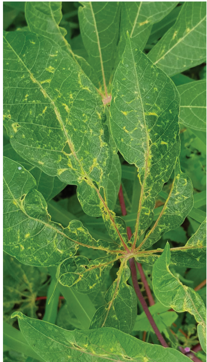
Fig. 2. Injuries to the leaves of cassava by Corynothrips stenopterus , Earth University Academic farm, Limon, Costa Rica.

action (IRAC 2018). The insecticides were purchased from local agrochemical stores in Costa Rica. The following insecticides were used in the bioassays: chlorfenapyr (Sunfire® 24 SC, Agrotico); imidacloprid (Muralla Delta® 19 OD, Agrotico); chlorpyrifos (Sassex® 48 EC, Agrotico); spinosad (Spintor® 12 CS, Centro Agrícola Guácimo); malathion (Agromart malathion® 60 EC, Colono Agropecuario); thiamethoxam (Actara® 25 WG, Cafesa); spinetoram (Winner® 6 SC, Colono Agropecuario); and \alpha -cypermethrin (Arrivo® 25 EC, Colono Agropecuario).