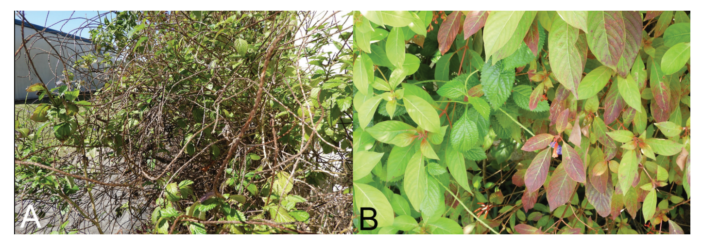
Fig. 5. Feeding damage of Petrusa epilepsis on Stachytarpheta jamaicensis (blue porterweed) (A) and Hamelia patens (firebush) (B).

Table 5. Host plants of Petrusa epilepsis (Hemiptera: Flatidae) recorded from first detection<sup>1</sup> and from the survey conducted in Jan 2018 at the University of Florida, Fort Lauderdale Research and Education Center, Davie, Florida<sup>2</sup>.